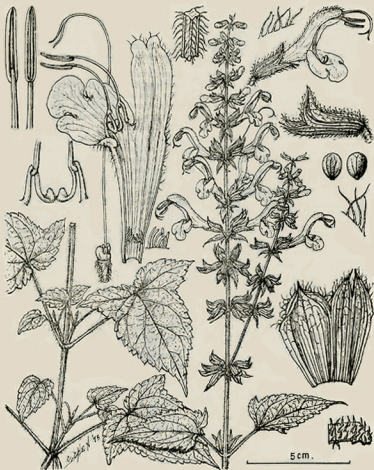
Pl. 6. Salvia nipponica Miq. var. formosana (Hayata) Kudo