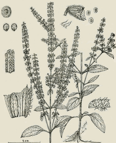
Pl. 7. Salvia plebeia R. Br.