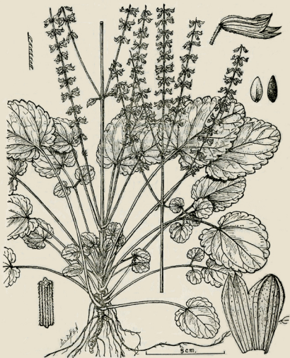
Pl. 8. Salvia scapiformis Hance