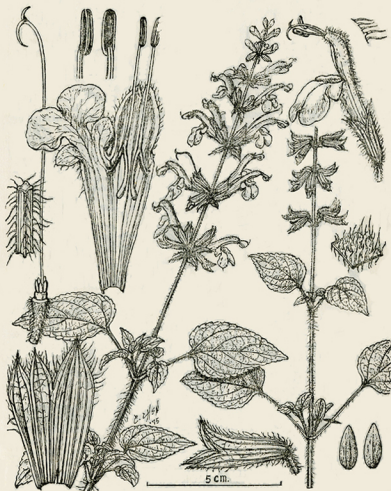
Pl. 2. Salvia coccinea Juss.