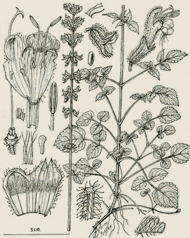
Pl. 4. Salvia japonica Thunb. var. taipingshanensis (Wu & Huang) Huang & Wu