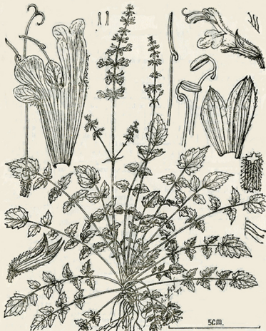
Pl. 3. Salvia huysmansii Makino