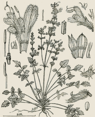
Pl. 1. Salvia arisanensis Hayata