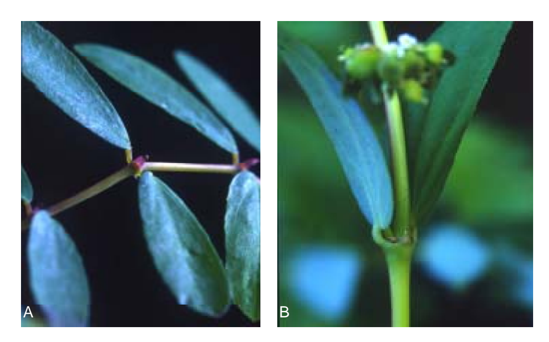
Fig. 6. Stipules of Chamaesyce hypericifolia (A) and C. hyssopifolia (B).

Habitat and Ecology: C. hypericifolia was first collected in Hualien in 2002 in garden at Shiang-young Village and is now a wide spread weed in the eastern part of the island. Locally it occurs in some places of the dry and wet lowlands, such as gardens, roadsides and waste ground; also along borders of ponds and marshes. The plant grows in association with other weedy plants commonly found in disturbed areas, such as Aster subulatus Michx. , Bidens pilosa L. var. radiata Sch.-Bip., Emilia sonchifolia (L.) DC. var. japonica (Burm. f.) Mattfeld, Chenopodium serotinum L., Veronica undulata Wall., and Mazus pumilus (Burm. f.) Steenis. Flowering and fruiting are throughout the year.