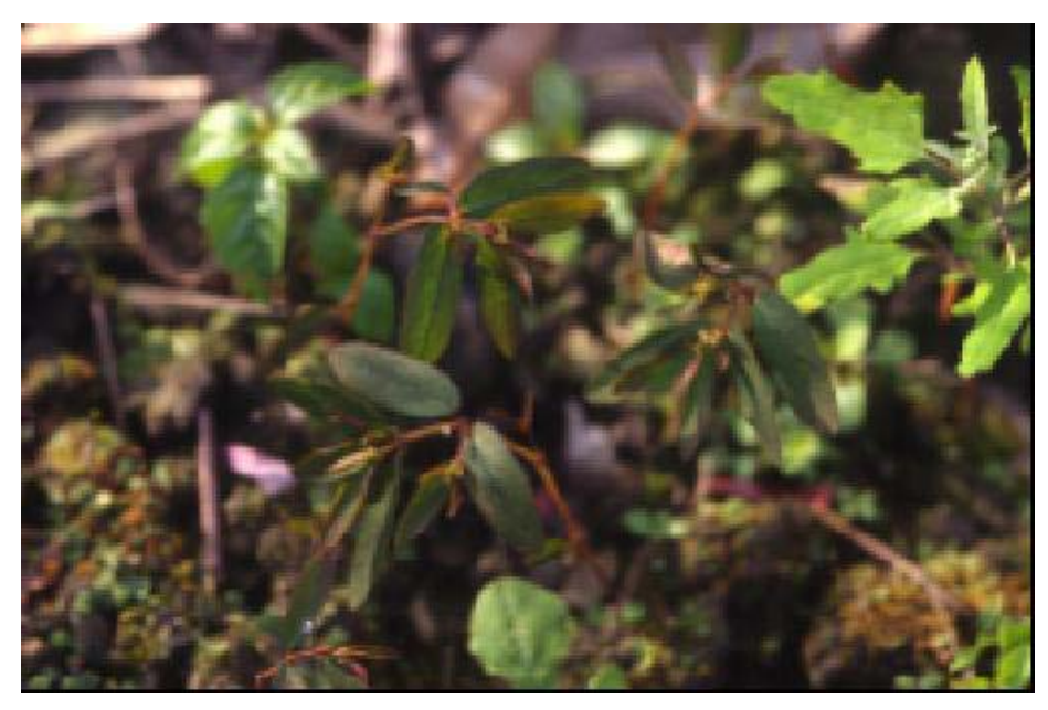
Fig. 2. Chamaesyce hypericifolia in its natural habitat.