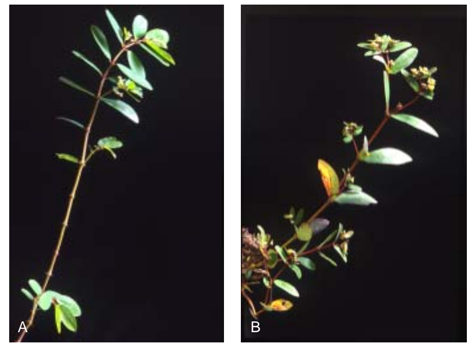
Fig. 3. Chamaesyce hypericifolia (A) and C. hyssopifolia (B), showing the similar flowering branches.

Staminate flowers 10-15, tiny, filaments 0.5-1 mm long, anthers yellow flushed with purplish red, 0.4 mm long. Pistillate flower l, exserted, style and stigma white, 0.5 mm long, styles 3, each 2-cleft, ovary green, ovoid, 0.8 mm across, with a long pedicel 0.5-1 mm long. Capsule glabrous, 3-lobed, globose, broader below the middle, 1.3 mm long and 1.5 mm wide, brownish when mature; seeds reddish brown, ovoid, 1.1 mm long and 0.7 mm wide, with 4 lateral ridges on each face, the surface with 2-4 depressions, mucilaginous when wet.