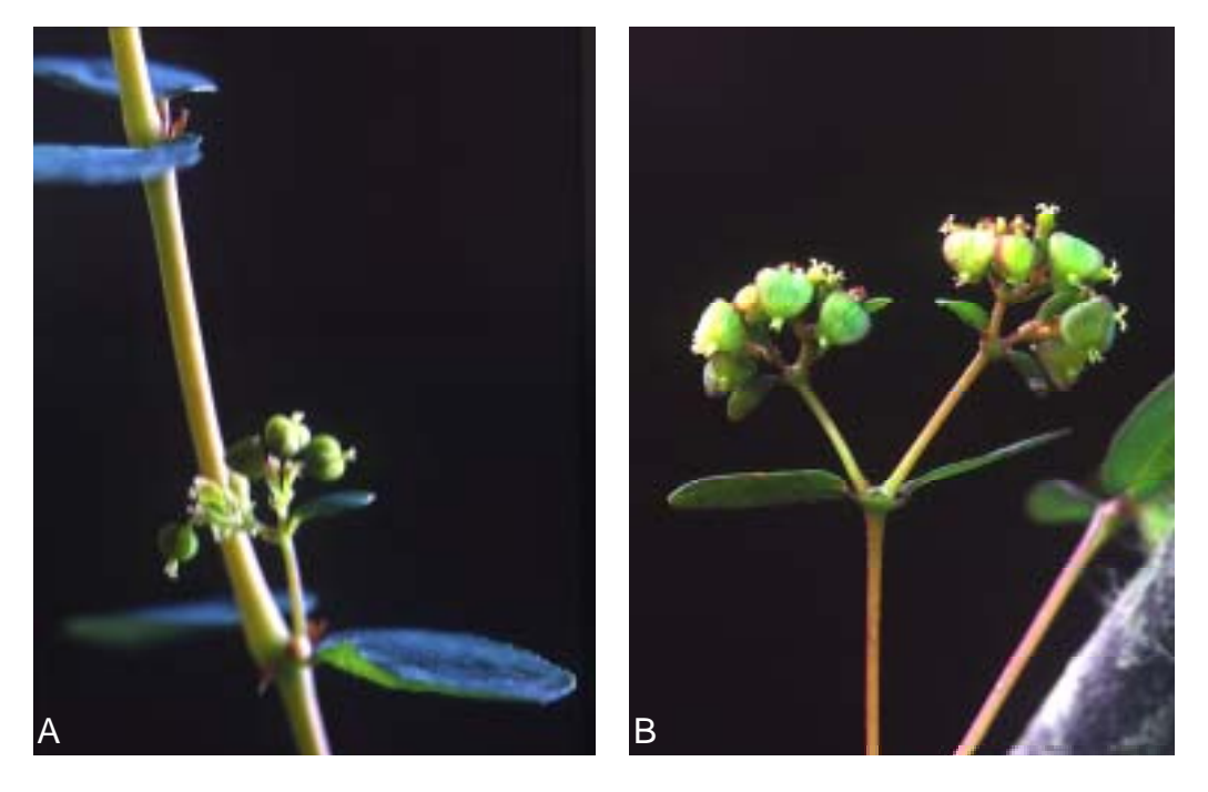
Fig. 5. Capsules of Chamaesyce hypericifolia (A) and C. hyssopifolia (B).

November 30, 2002, M.-Y. Ree & C.-W. Ho s. n. ; same loc., November 19, 2002, C.-L. Tsai s. n. (all at HLTC); Quang-fu Hsiang, near Quang-fu Sugar Factory, under Quang-fu Bridge, July 22, 2003, Y.-H. Young s. n. ; same loc., April 9, 2003, Y.-C. Chou s. n. ; along Mataian Hsi (River), May 10, 2003, C.-L. Young s. n. (all at HLTC); Gi-an Hsiang, Nanhua, Lotus Village, in garden, along border of pond, May 12, 2003, S.-H. Chen s. n. , (HLTC). Taitung Co.: Da-zen Hsiang, along An-so Hsi (River), backyard of Heaven Temple, June 29, 2003, Y.-C. Liou & Y.-C. Su s. n. (HLTC); Bei-nan Hsiang, near Gymnastic Exp. High School, June 30, 2003, C.-F. Lin & L.-Y. Chen s. n. (HLTC).