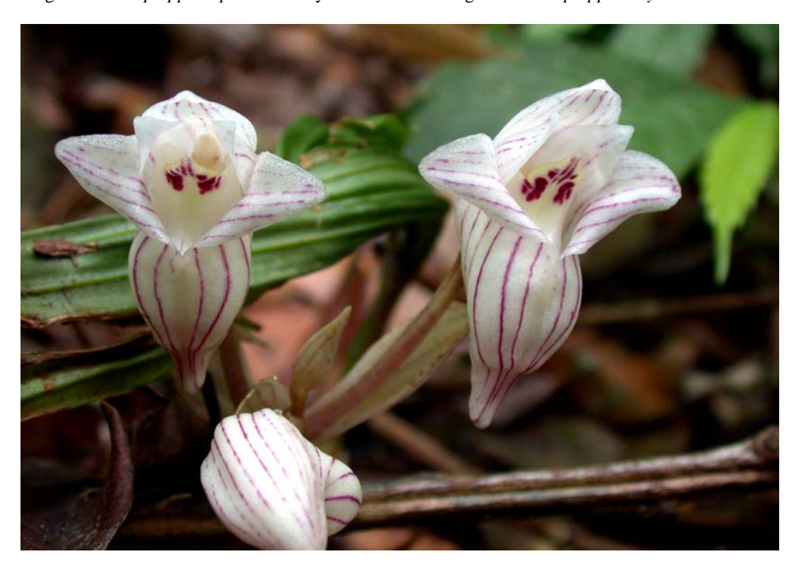
Fig. 3. Acanthephippium striatum Lindl.