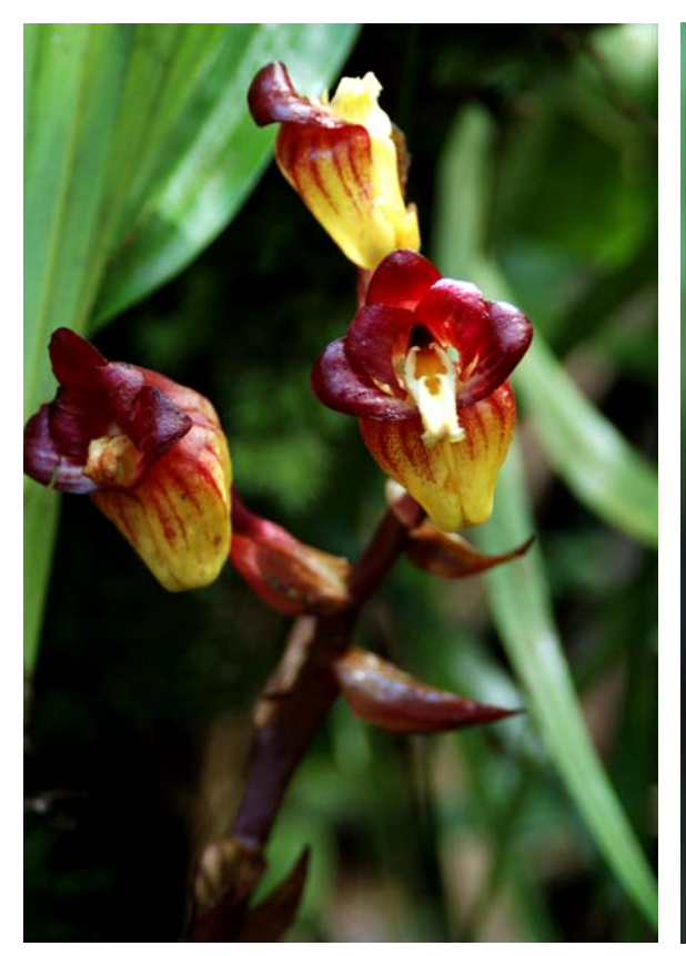
Fig. 2. Acanthephippium pictum Fukuy.