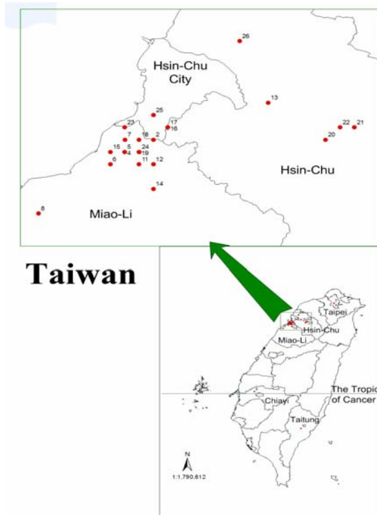
Fig. 1. Geographical location of test localities.