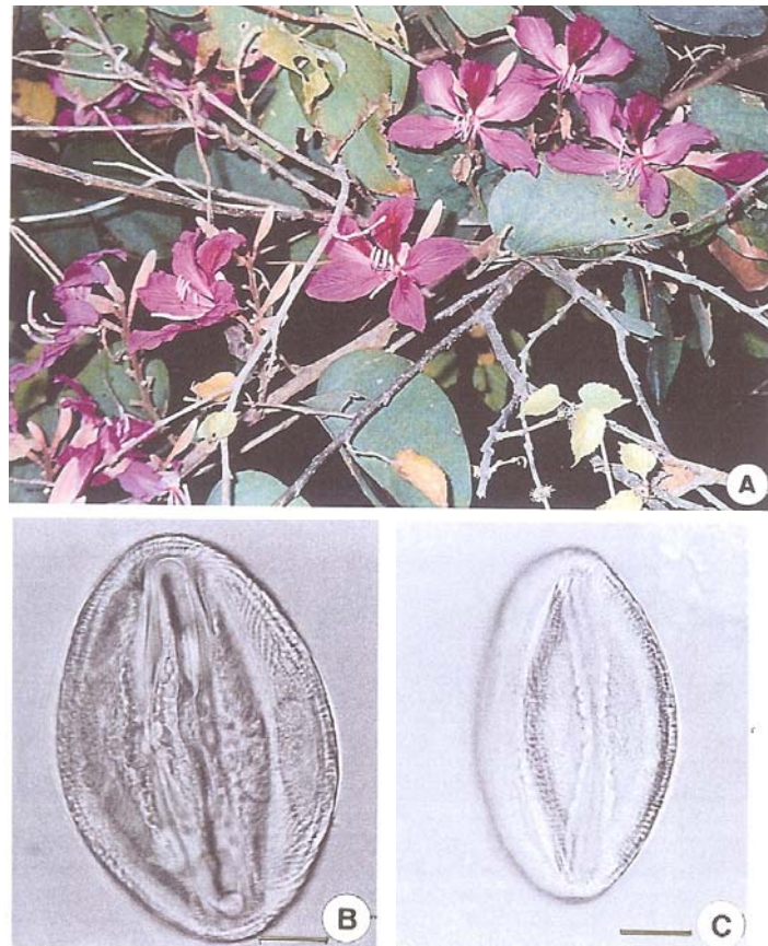
Fig. 2. Bauhinia purpurea L. (locality 14). A: Habit. B: A fresh pollen grain. C: An adhesive pollen grain. (Bar = 10 \mu\text{m} )