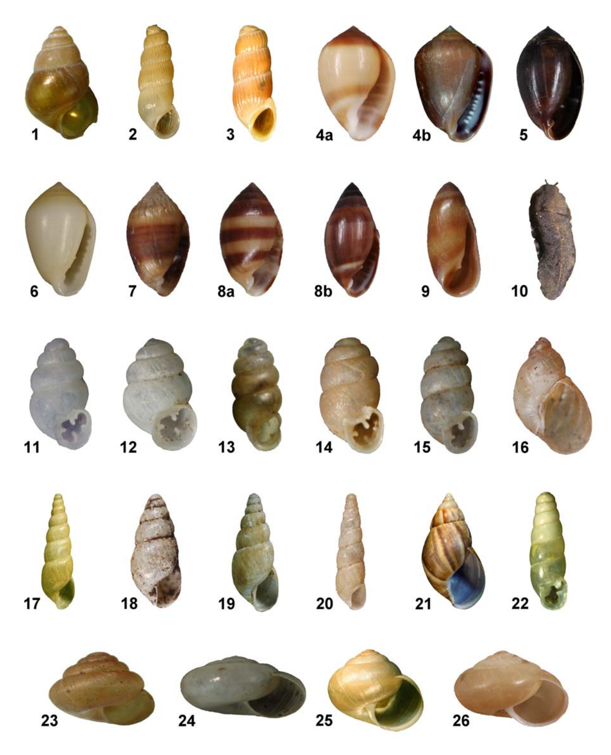
Fig. 2. Land molluscan of the Dongsha Island. 1: Assiminea nitida (2.4 mm). 2: Truncatella guerinii (10 mm). 3: T. pfeifferi (7 mm). 4a: Melampus castanea (juvenile, 7 mm). 4b: M. castanea (adult, 12 mm). 5: M. nuxeastaneus (11 mm). 6: M. flavus (15 mm). 7: M. sculptus (6.8 mm). 8a, 8b: M. taeniolatus (8 mm). 9: Tralia malanastoma (5.8 mm). 10: Laevicaulis alte (52 mm). 11. Gastrocopta pediculus (2.5 mm). 12: G. pediculus ovatula (2 mm). 13: G. servilis (2.4 mm). 14: Nesopupa yamagutii (1.8 mm). 15: Vertigo sp. (3 mm). 16: Succinea erythrophana (9 mm). 17: Lamellaxis gracilis (11 mm). 18: L. turgidulum (5.6 mm). 19: Paropeas achatinaceum (9 mm). 20: Subulina octona (16.7 mm). 21: Achatina fulica (80 mm). 22: Indoennea bicolor (6 mm). 23: Liardetia yaeyamensis (3.5 mm). 24: Zonitoides arboreus (4.3 mm). 25: Acusta tourannensis (20 mm). 26: Bradybaena similaris (14 mm).