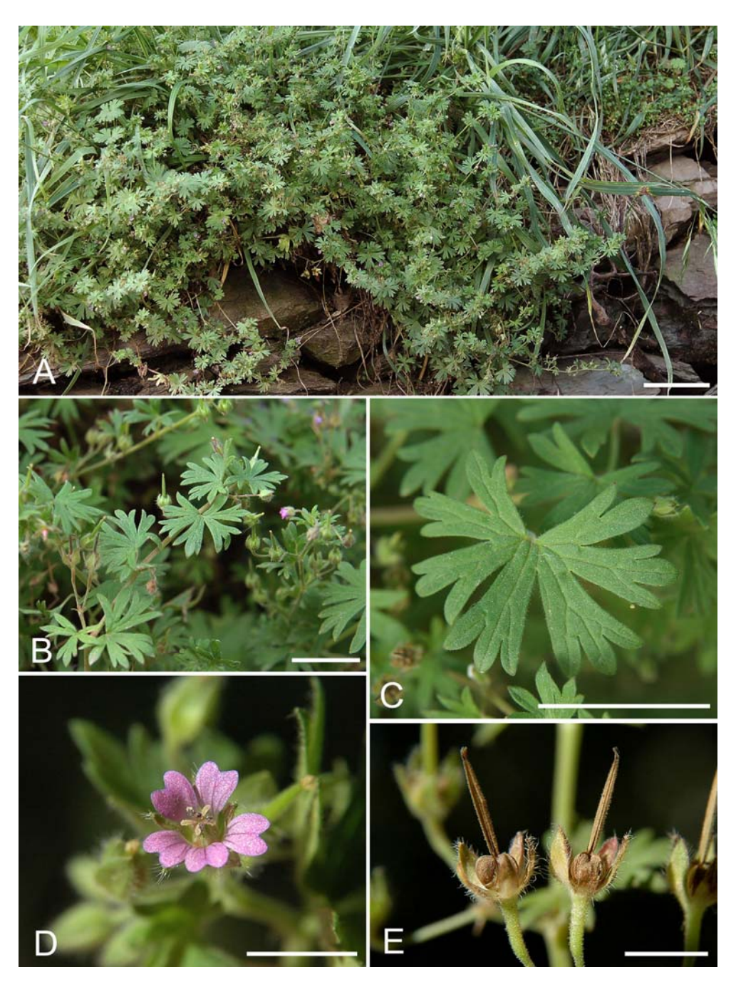
Fig. 2. Geranium pusillum L. A: Habit. B: Branch and inflorescence. C: Leaf. D: Flower. E: Fruits. Scale bar A = 5 cm; bars B and C = 1 cm; bars D and E = 5 mm.

Notes: This species was found in exposed area, and is sometimes distributed near the similar species G. molle in Taiwan. Both species are in the subgenus Robertium , which is characterized by the "carpel-projection" type fruit discharge (other congeners in Taiwan also have fruit of the "seed-ejection" type), and are also in the same section Batrachioidea by the shallowly divided leaves and blue pollens.