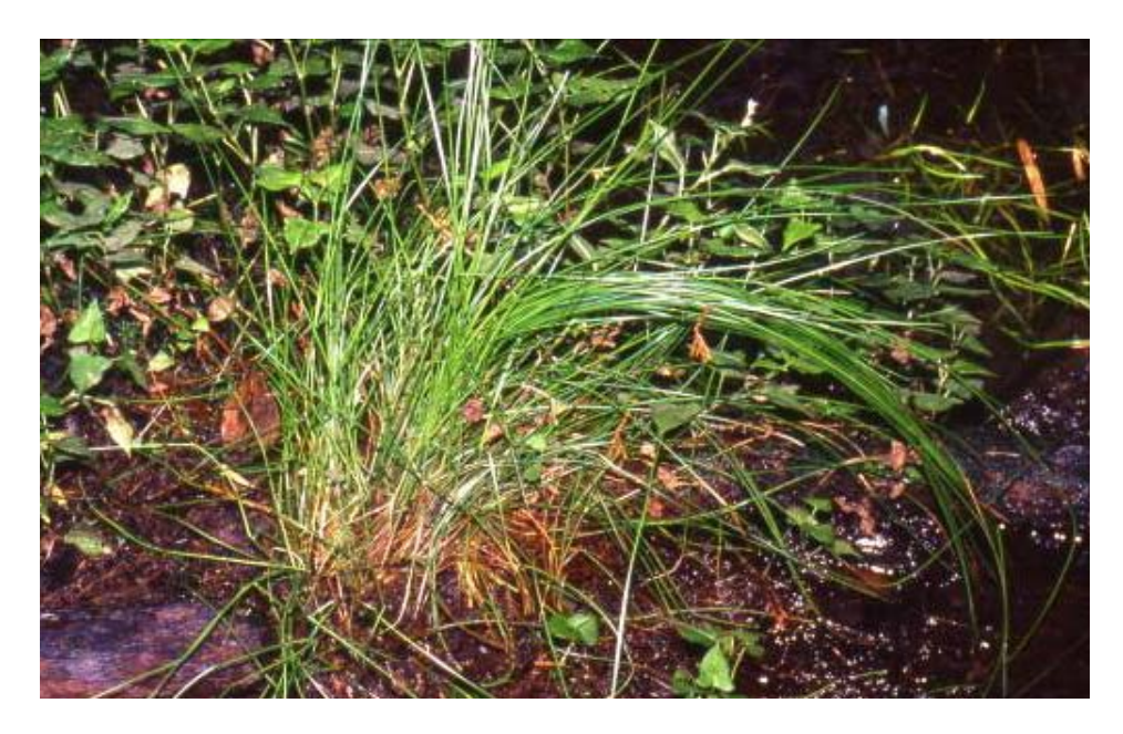
Fig. 1. Habit of Juncus tobdenii Noltie in Taiwan (Yuanyang Lake).