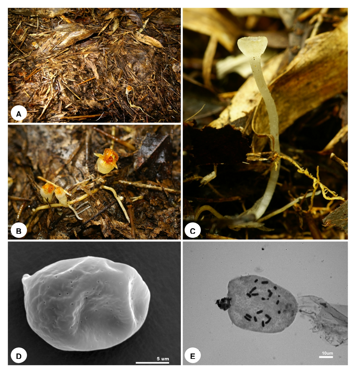
Fig. 1. Thismia huangii P. Y. Jiang et. T. H. Hsieh. showing habitat (A), flower (B), fruit with elongated pedicel (C), SEM micrograph of pollen with microportoration on tectum (D), and somatic chromosome 2n = 18 (E).