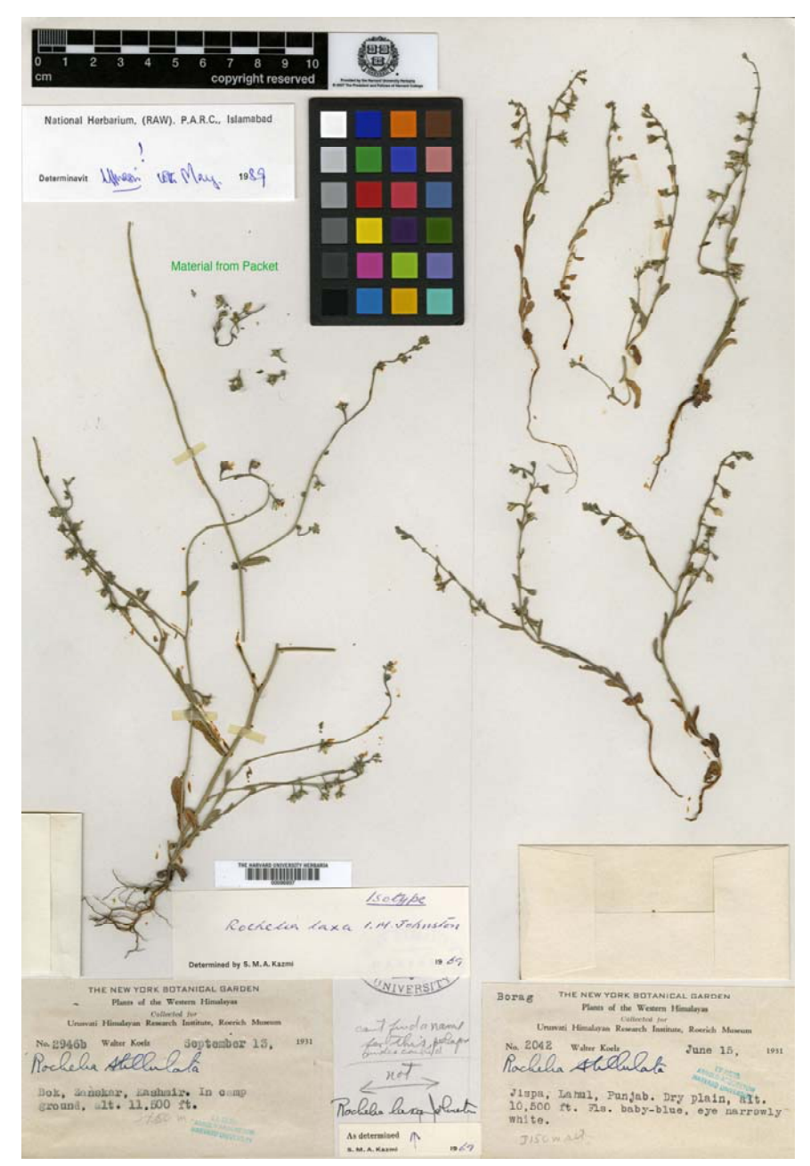
Fig. 2. The scanned lectotype image of Rochelia laxa I. M. Johnst (deposited at GH).

permission to publish the image of the type specimen. We also thank Sri Gautam Kr. Upadhyay, Ex- SRF, CNH, BSI for helping us in various ways during finalization of the manuscript.