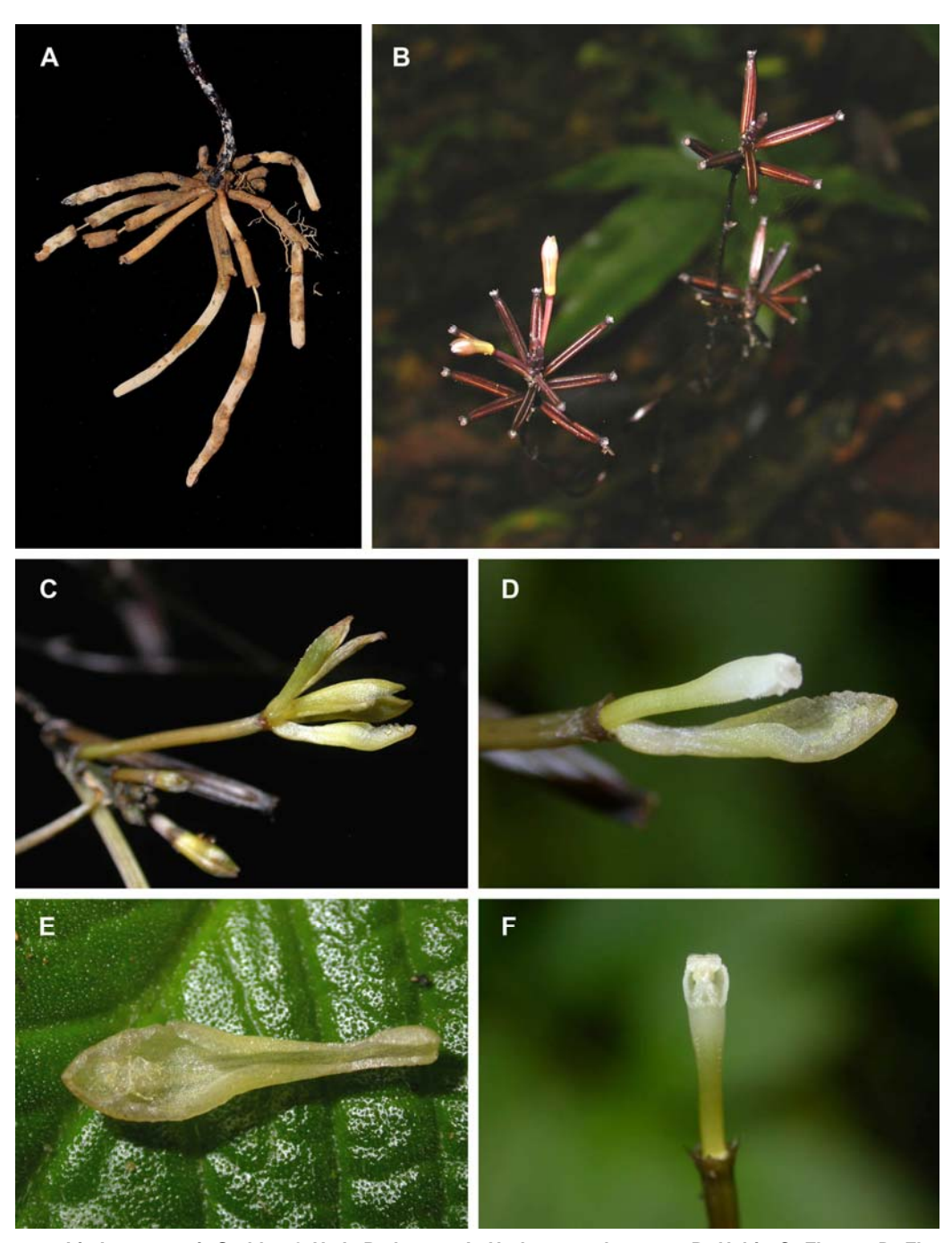
Fig. 2. Lecanorchis betongensis Suddee & H. A. Pedersen. A: Underground organs. B: Habit. C: Flower. D: Flower (sepals and petals removed). E: Labellum. F: Column. A–F: Wai 2003.

glabrous, ca. 0.5 mm long, margin irregularly denticulate. Capsule black, fusiform, 2-2.3 cm long, 2-2.2 mm in diameter.