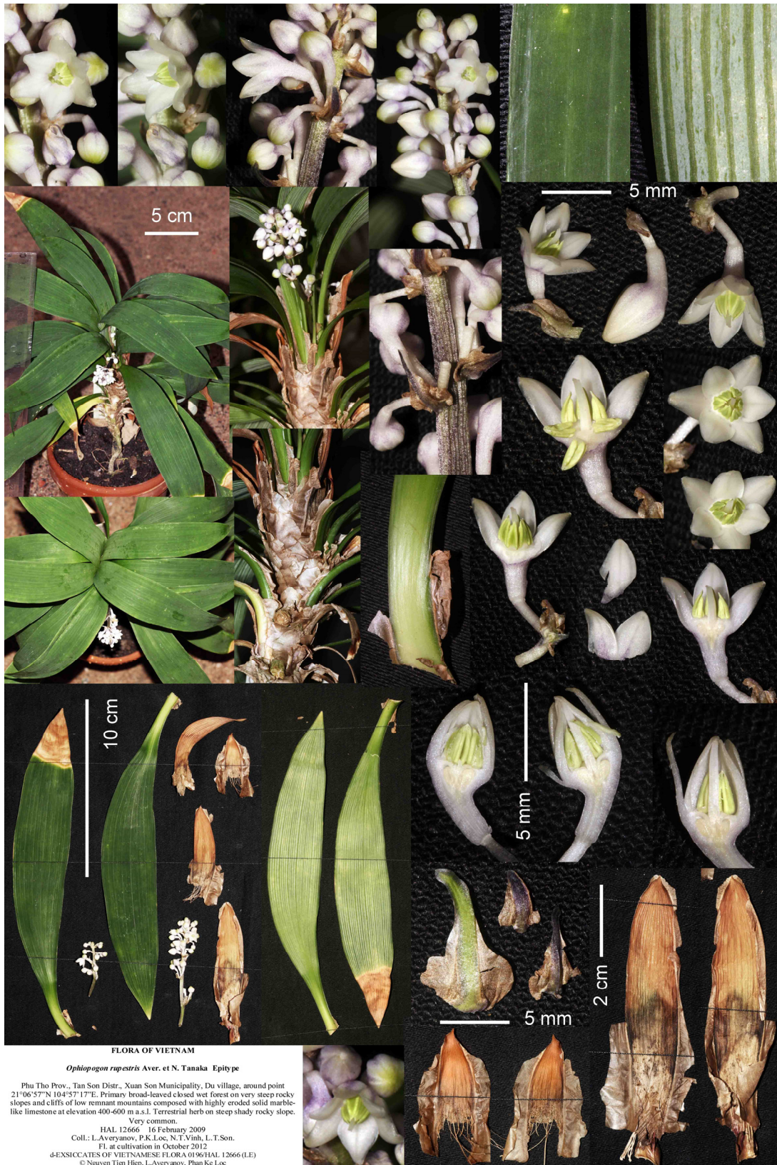
Fig. 1. Ophiopogon rupestris Aver. et N.Tanaka. Digital epitype: d-EXSICCATES OF VIETNAMESE FLORA 0196/HAL 12666 (all photos and design by L. Averyanov).