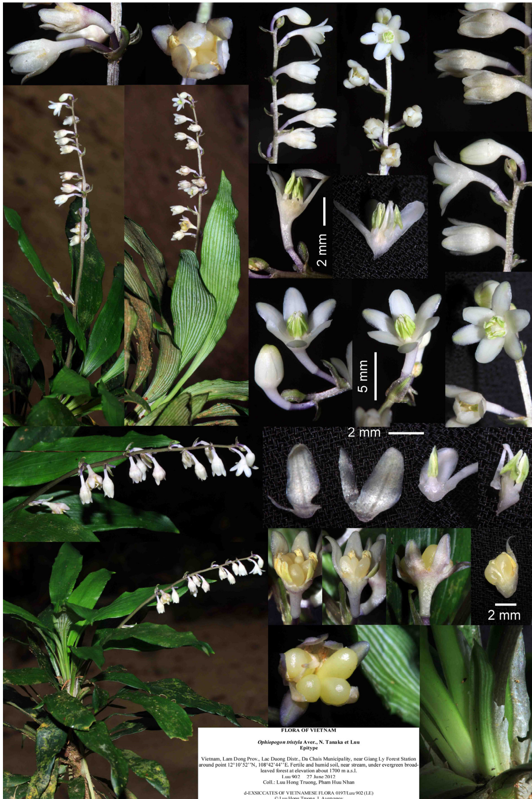
Fig. 2. Ophiopogon tristylatus Aver., N.Tanaka et Luu. Digital epitype: d-EXSICCATES OF VIETNAMESE FLORA 0197/Luu 902, 923 (all photos by Luu Hong Truong, design by L. Averyanov).