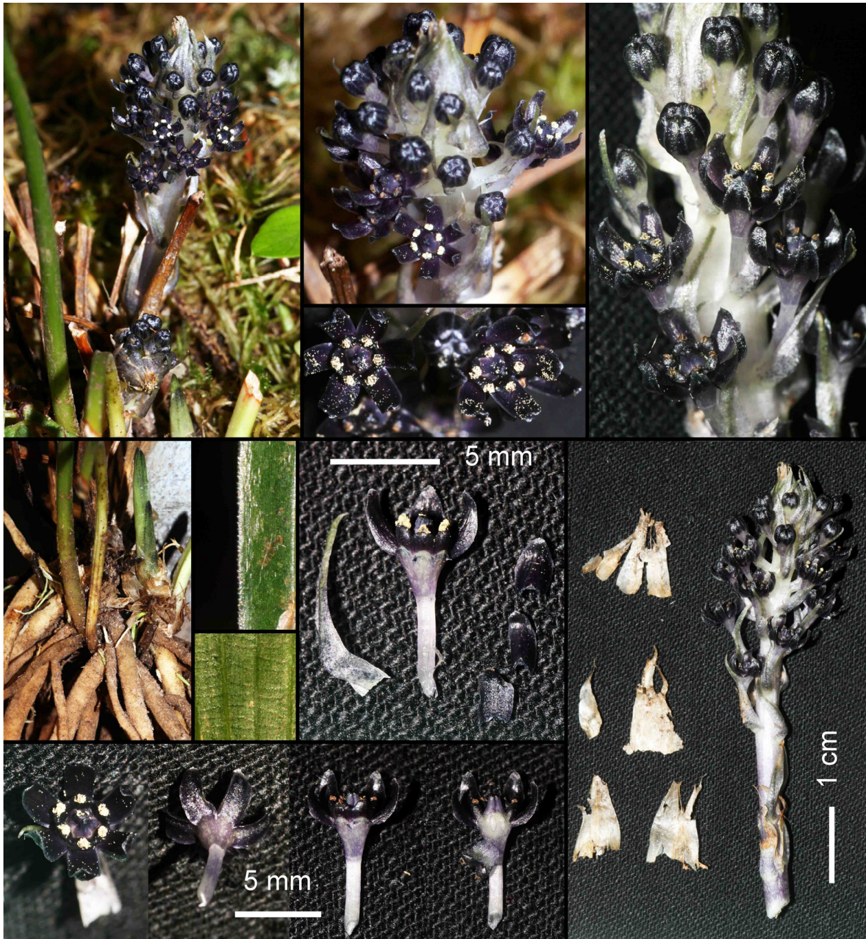
Fig. 5. Peliosanthes cambodiana Aver. et N.Tanaka. Type specimen, inflorescence and flowers M. Telepova et al. 967 , coll. on 26 November 2012 (all photos and design by L. Averyanov).

straight, (1)2–3(4) cm long, 2.5–3.5 mm in diam.; sterile bracts on peduncle 4–6, distant, herbaceous, cuneate, acuminate, white, finely speckled with black-violet, 8–15 mm long, 2–3(4) mm wide at base; rachis straight, thick, white, (3)4–6(8) cm long. Floral bracts 2 at base of each pedicel, scarious, white, finely speckled with gray-violet, cuneate, gradually tapering into acute apex; outer bract (4)6–8 mm long, (0.8)1–2 mm wide; inner