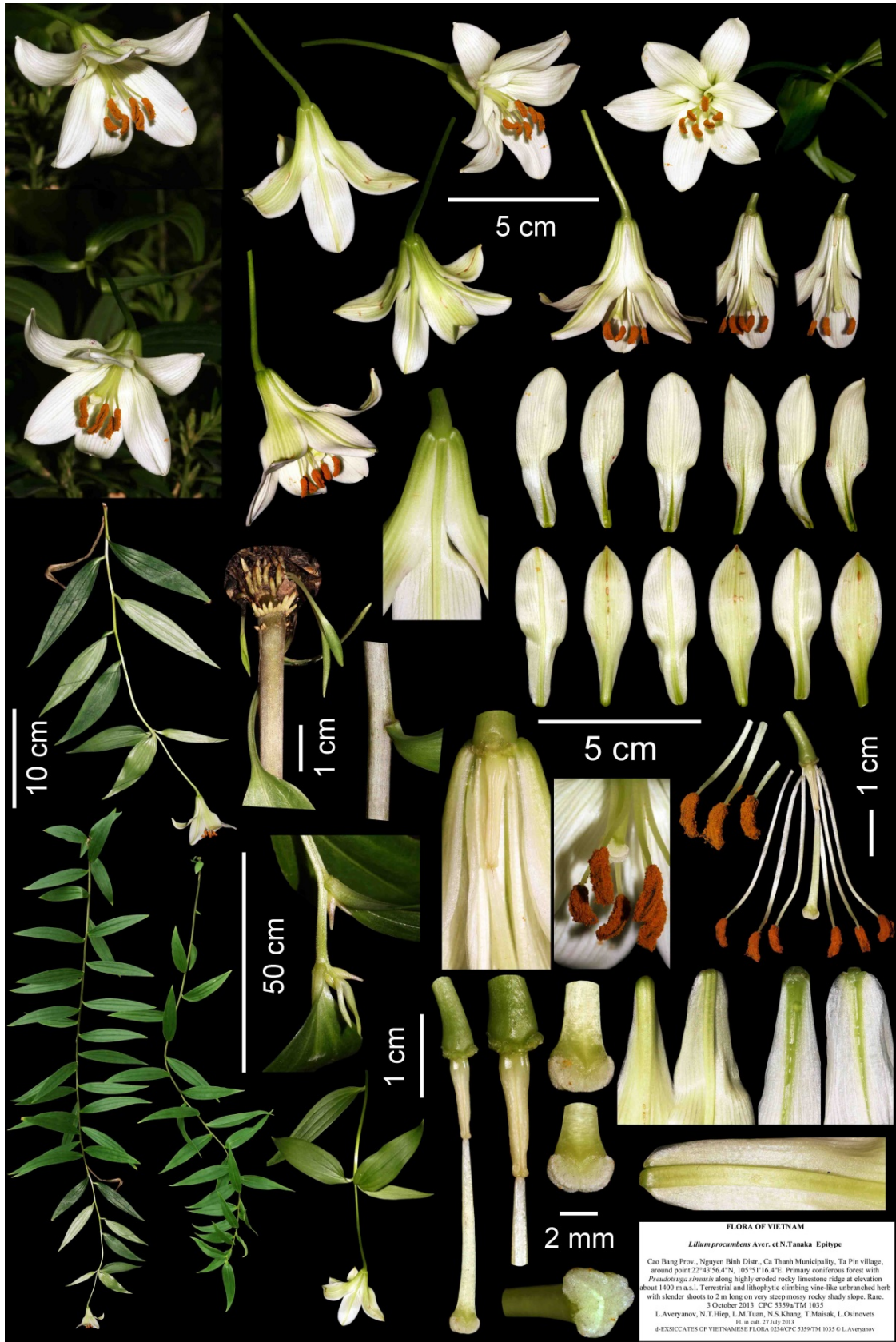
Fig. 2. Lilium procumbens sp. nov. Digital eptype, L. Averyanov CPC 5359a/TM 1035. Photos, correction and design by L. Averyanov.