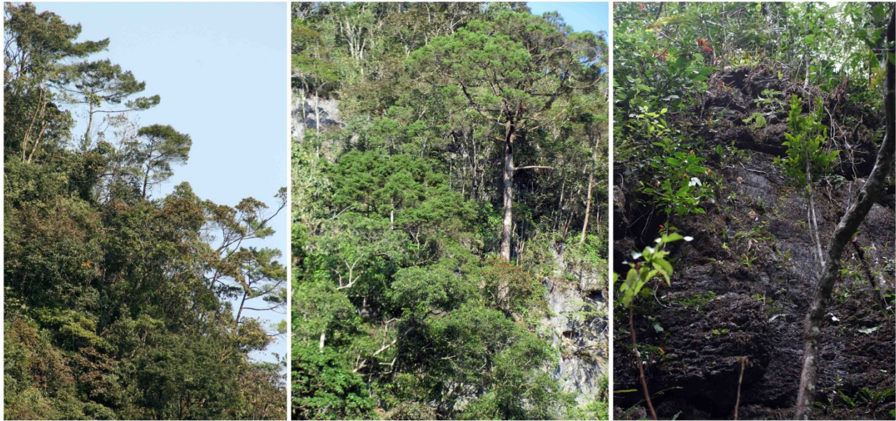
Fig. 1. Scenery of habitats of Lilium procumbens.