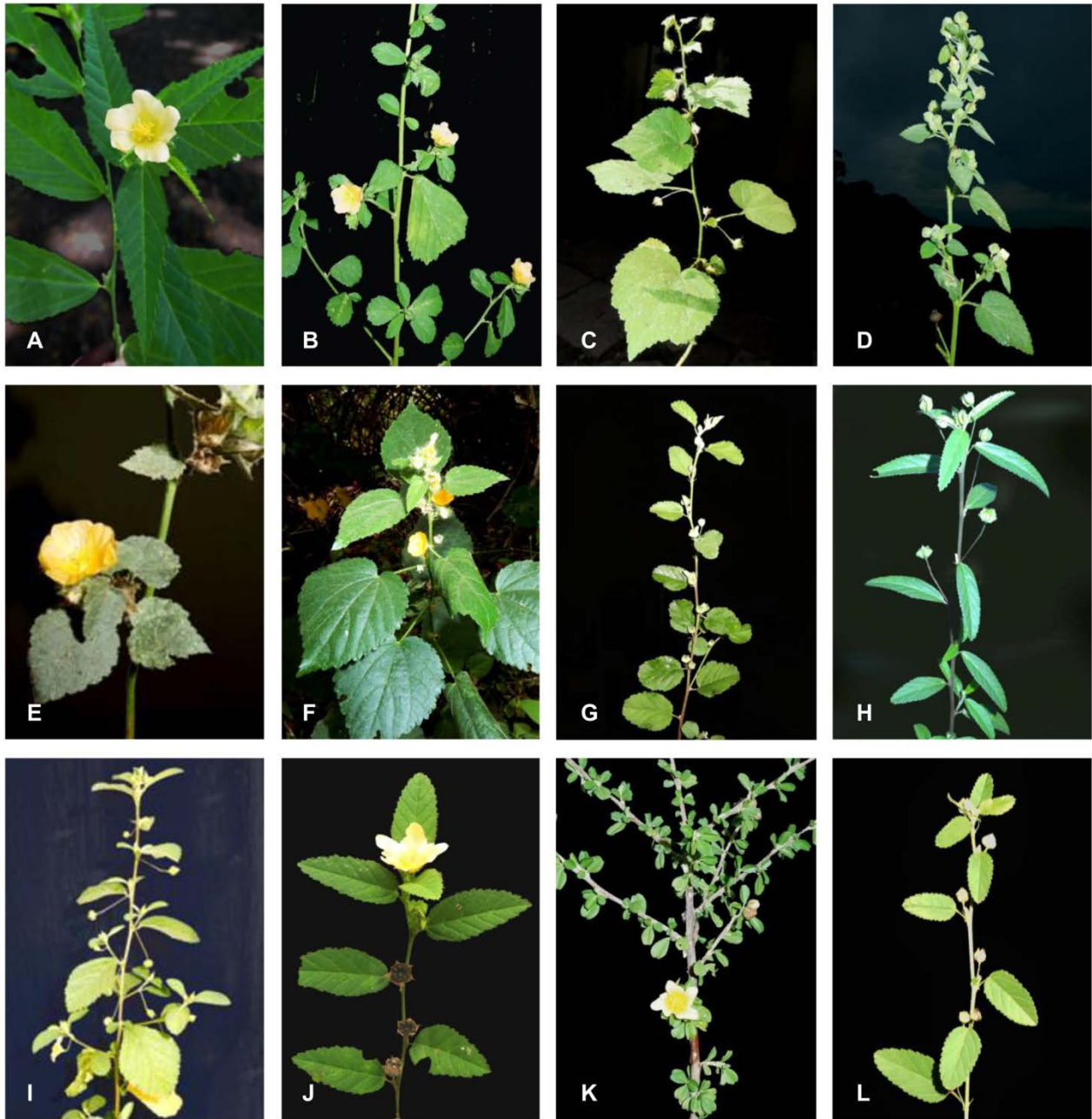
Fig. 2. Morphological features of Sida L. from Maharashtra, India. A: Sida acuta Burm. f., B: Sida alnifolia L., C: Sida cordata (Burm. f.) Borss., D: Sida cordifolia L., E: Sida elongata Blume var. balica (Miq.) Borss., F: Sida mysorensis Wight & Arn., G: Sida ovata Forssk., H: Sida rhombifolia L., I: Sida rhomboidea Roxb. ex Fleming, J: Sida scabrida Wight & Arn., K: Sida schimperiana Hochst. ex A. Rich., L: Sida spinosa L.

2. Sida alnifolia L., Sp. Pl. 2, 684. 1753; Sivar. & Pradeep, Sida 16(1): 69. 1994 & in Malv. South. Penins. India 241, f. 85. 1996. S. retusa L., Sp. Pl. ed. 2. 961. 1763. S. rhombifolia L. subsp. retusa (L.) Borss. in Blumea 14: 198, f. 21e-h. 1966; Paul in Sharma et al. (eds.), Fl. India 3: 289. 1993; Venkanna & Das Das in Singh et al. , Fl. Maharashtra St. (Dicot.) 1: 328. 2000. S. rhombifolia L. var. retusa (L.) Cooke, Fl. Pres. Bombay 1: 99. 1958; Almeida, Fl. Maharashtra 1: 126. 1996.