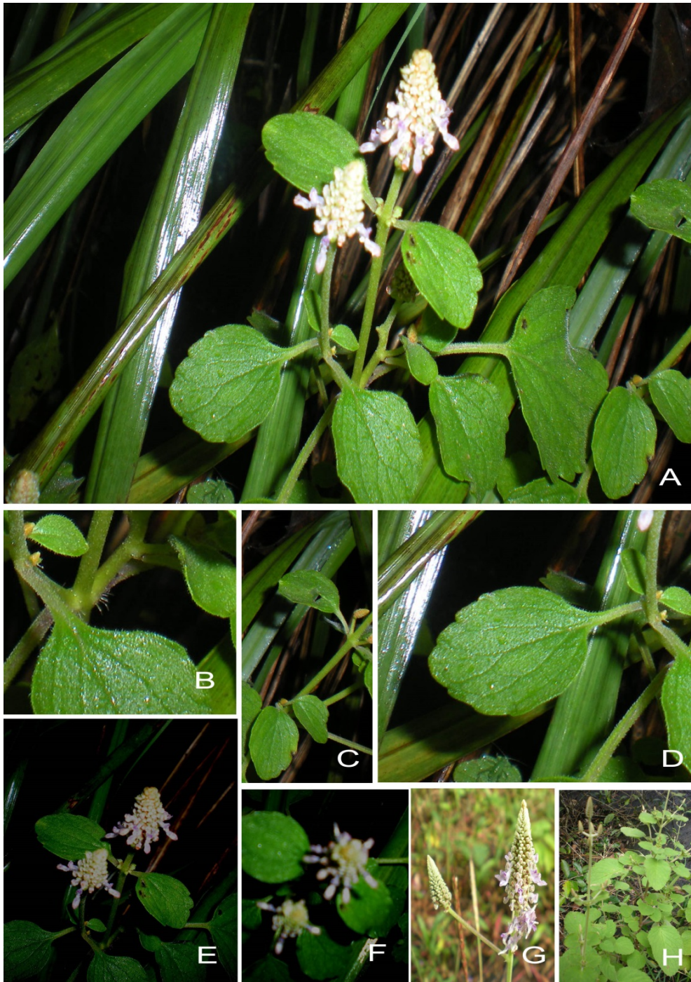
Fig. 1. Anisochilus petraeus J. Mathew & Yohannan. A: In habitat. B: Oblique leaf base. C: Young inflorescence. D: Half serrated leaves. E & F: Top view of inflorescence. G: Inflorescence of A. carnosus . H: Habitat of A. carnosus (see the cordate leaf base and fully serrated leaf margins).

faintly aromatic, pubescent above and slightly tomentose beneath, lateral veins 3 pair. Petiole up to 6 mm long. Inflorescence terminal and axillary, simple and unbranched, peduncle quadrangular in shape and 1–3 cm long, not branched, green and pubescent. Spike tetragonal with rows of bracts in bud and becoming cylindrical after anthesis, 2.5–3.5 × 1–2 cm in size.