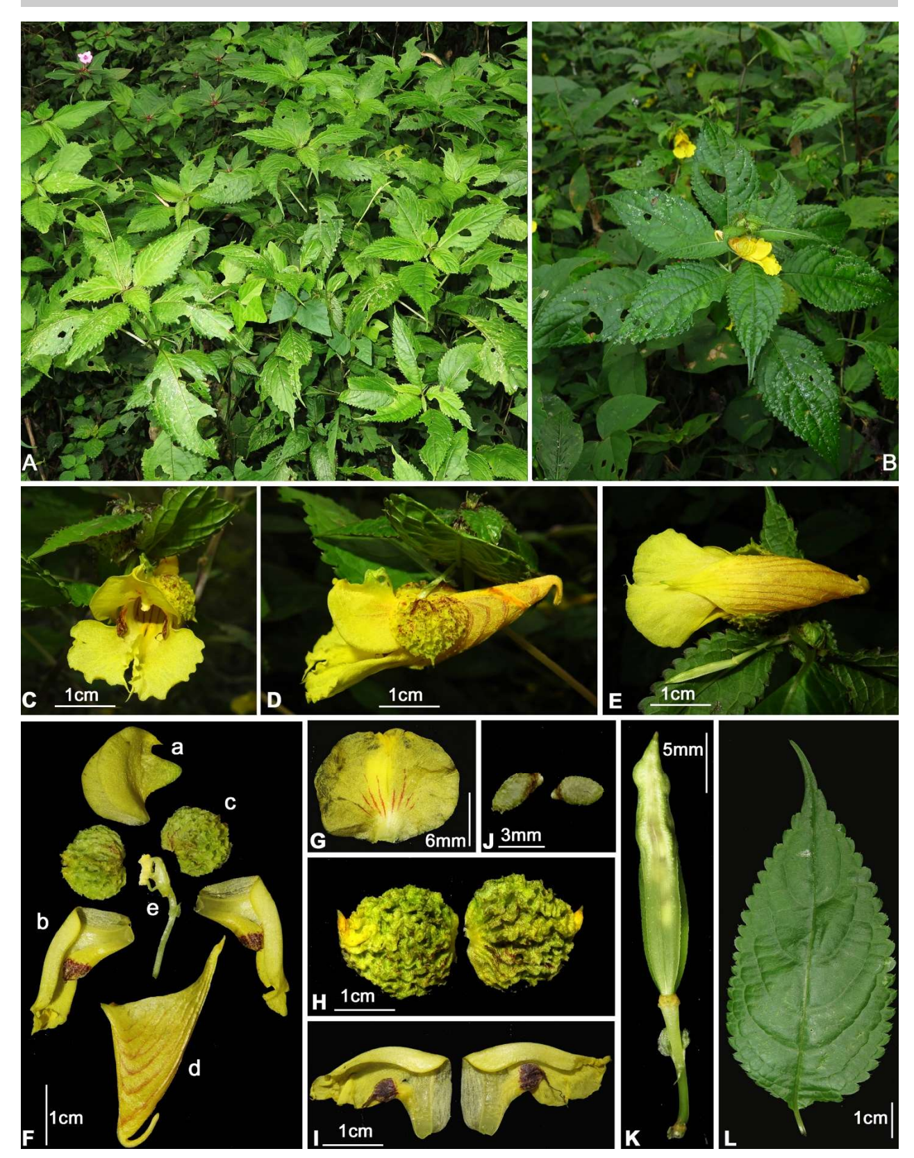
Fig. 2. Impatiens plicatisepala C. Y. Zou, Yan Liu & S. X. Yu A. Habitat, B. Habit, C. Flower, front view, D. Flower, lateral view, E. Flower, bottom view, F. Dissected floral parts, a. dorsal petal, b. lateral united petals, c. lateral sepals, d. lower sepal, e. stamens, G. Dorsal petal, adaxial view, H. Lateral sepals, I. Lateral united petals, J. Seeds, K. Capsule, L. Leaf.