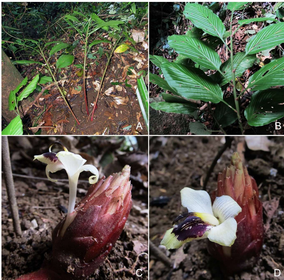
Fig. 3. Zingiber tamii N.S.Lý & Škorničk. A. Plant habit. B. Leaves and petioles. C. Inflorescence with a flower (side view). D. Inflorescence with a flower (semi-top view). from the type Lý-1323.

base, semi-translucent white, externally puberulous, with unilateral incision ca. 9.5 mm long, apex with three inconspicuous blunt teeth; floral tube narrowly cylindrical, slightly widening distally, 30–33 mm long, externally and internally cream-white at base, white apically, externally sparsely pubescent, internally glabrous at base, sparsely pubescent apically near the throat; dorsal corolla lobe triangular-ovate, 23–25 × 9–10 mm, pale yellow with semi-translucent veins, glabrous, apex acute, shortly mucronate, mucro ca. 0.5 mm long; lateral corolla lobes narrowly triangular-ovate, 21–23 × 6.4–7.5 mm, pale yellow with semi-translucent veins, glabrous, apex narrowly acute; labellum elliptic to slightly elliptic-obovate with obtuse apex, 20–24 mm long, 11–12 mm at widest point near the middle of