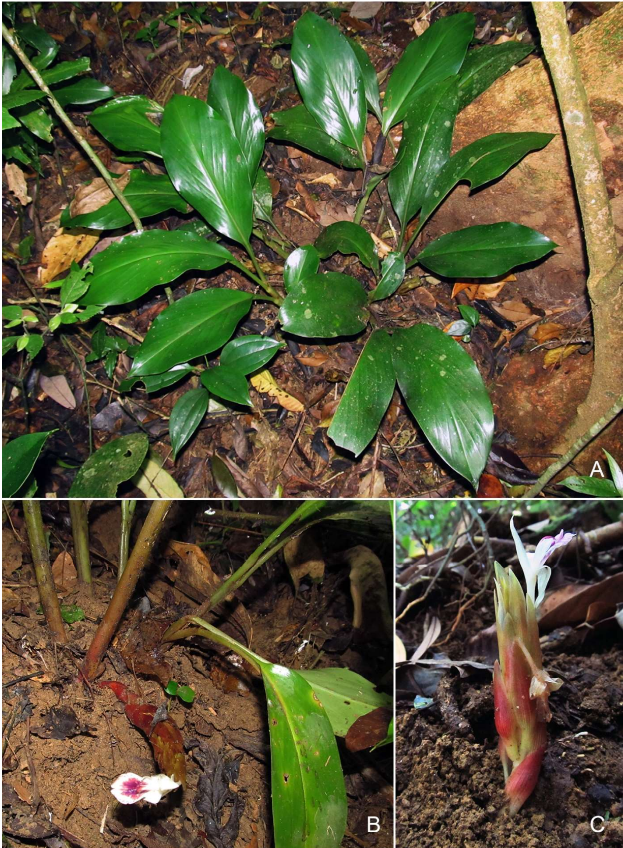
Fig. 1. Zingiber magang N.S.Lý & Škorničk. A. Habit. B. Basal part of the plant with an inflorescence. C. Inflorescence with a flower (side view). from the type Lý-1327.