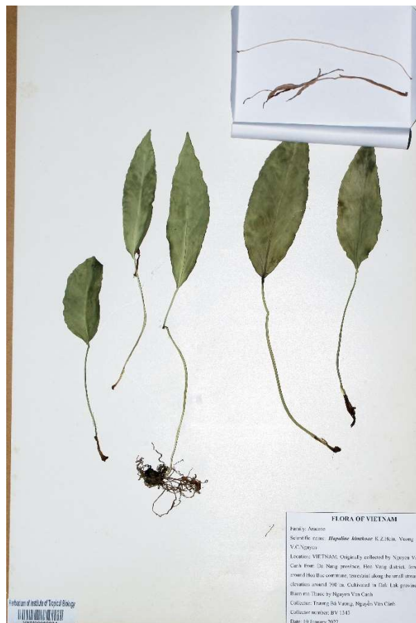
Fig. 3. Holotype of Hapaline kimthoae sp. nov.

herb up to 28 cm tall. Stem tuberous, ± cylindric, 1.3–1.5 cm in diam.; stolons unknown; roots 1–2 mm in diam. Leaves 2–5 together; petiole 9.0–14.5 cm long, 0.3–0.4 cm in diam., slender, smooth, green, basal 1/3 subtended by dried membranous cataphyll; lamina lanceolate or elliptic-lanceolate, 11.0–14.5 long by 3–5 cm wide, thinly coriaceous, glabrous, dark green, occasionally with various pale green spots or blotchy markings adaxially, pale green abaxially, margin entire to repand, apex attenuate or acute, base cuneate or obtuse, slightly oblique; midrib impressed adaxially, prominently raised abaxially; primary lateral veins 4–6 per side, arising at 30–60° to the midrib, slightly impressed adaxially, impressed and clearly visible abaxially, anastomosing into intramarginal collective vein at 0.3–0.6 cm from margin; interprimary veins much less prominent, running into intramarginal collective vein; secondary and tertiary veins weakly visible abaxially. Inflorescence 2 together held level with or above the leaves; peduncle 16.5–18.5 cm long, 0.2–0.5 cm in diam., terete, smooth, pinkish white with reddish brown streaks and spots, subtended by cataphyll; cataphyll ca. 6 cm long, subhyaline, greenish brown, membranous, apex acute; spathe ca. 7 cm long; spathe limb narrowly linear-lanceolate, ca. 3.8 cm long, ca. 0.7 cm wide, curved, outside pinkish white, tessellated with reddish brown, inside pinkish white, apex acute and mucronate, base decurrent into lower spathe; lower