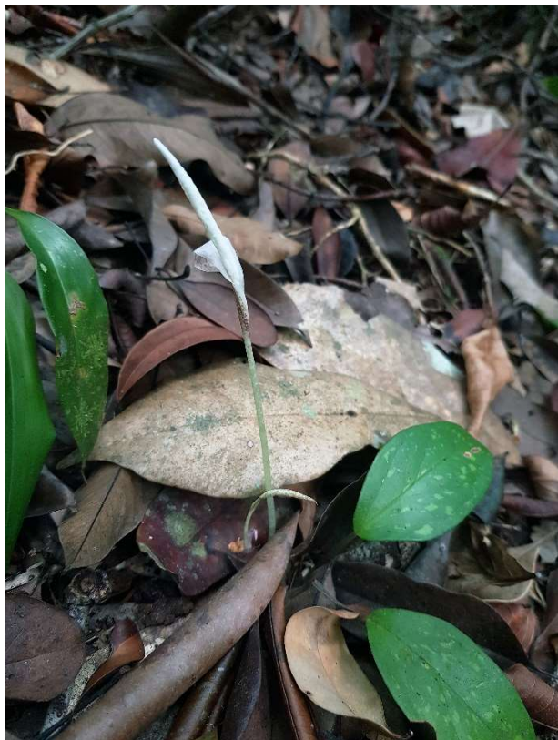
Fig. 2. Habit of Hapaline kimthoae sp. nov.

herb up to 28 cm tall. Stem tuberous, ± cylindric, 1.3–1.5 cm in diam.; stolons unknown; roots 1–2 mm in diam. Leaves 2–5 together; petiole 9.0–14.5 cm long, 0.3–0.4 cm in diam., slender, smooth, green, basal 1/3 subtended by dried membranous cataphyll; lamina lanceolate or elliptic-lanceolate, 11.0–14.5 long by 3–5 cm wide, thinly coriaceous, glabrous, dark green, occasionally with various pale green spots or blotchy markings adaxially, pale green abaxially, margin entire to repand, apex attenuate or acute, base cuneate or obtuse, slightly oblique; midrib impressed adaxially, prominently raised abaxially; primary lateral veins 4–6 per side, arising at 30–60° to the midrib, slightly impressed adaxially, impressed and clearly visible abaxially, anastomosing into intramarginal collective vein at 0.3–0.6 cm from margin; interprimary veins much less prominent, running into intramarginal collective vein; secondary and tertiary veins weakly visible abaxially. Inflorescence 2 together held level with or above the leaves; peduncle 16.5–18.5 cm long, 0.2–0.5 cm in diam., terete, smooth, pinkish white with reddish brown streaks and spots, subtended by cataphyll; cataphyll ca. 6 cm long, subhyaline, greenish brown, membranous, apex acute; spathe ca. 7 cm long; spathe limb narrowly linear-lanceolate, ca. 3.8 cm long, ca. 0.7 cm wide, curved, outside pinkish white, tessellated with reddish brown, inside pinkish white, apex acute and mucronate, base decurrent into lower spathe; lower