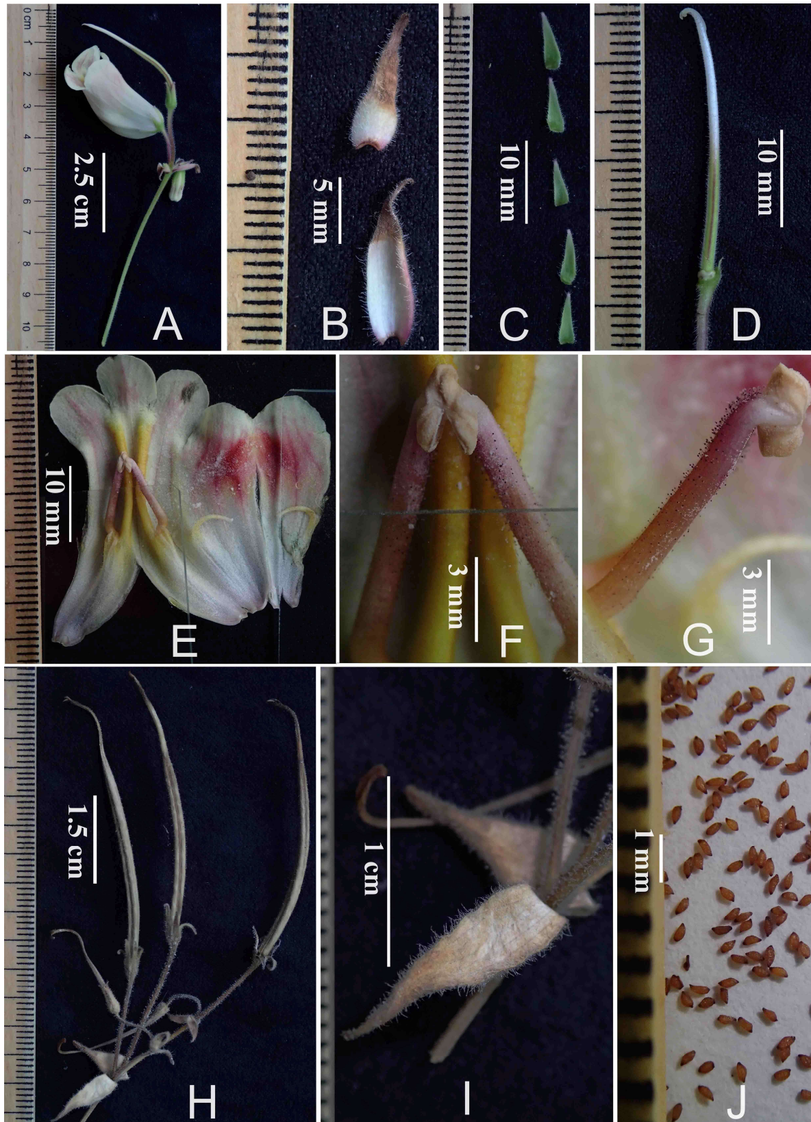
Fig 3. Photographs of Primulina jinyu F.Wen, L.Ding & X.C.Ke A. Cyme. B. The abaxial (upper) and adaxial (below) surfaces of bracts. C. Calyx segments. D. Pistil without calyx segments. E. Opened corolla. F. The top view of the anthers. G. The lateral view of anther. H. The dried infructescence. I. Dried bracts. J. seeds. (Photoed by Fang Wen).