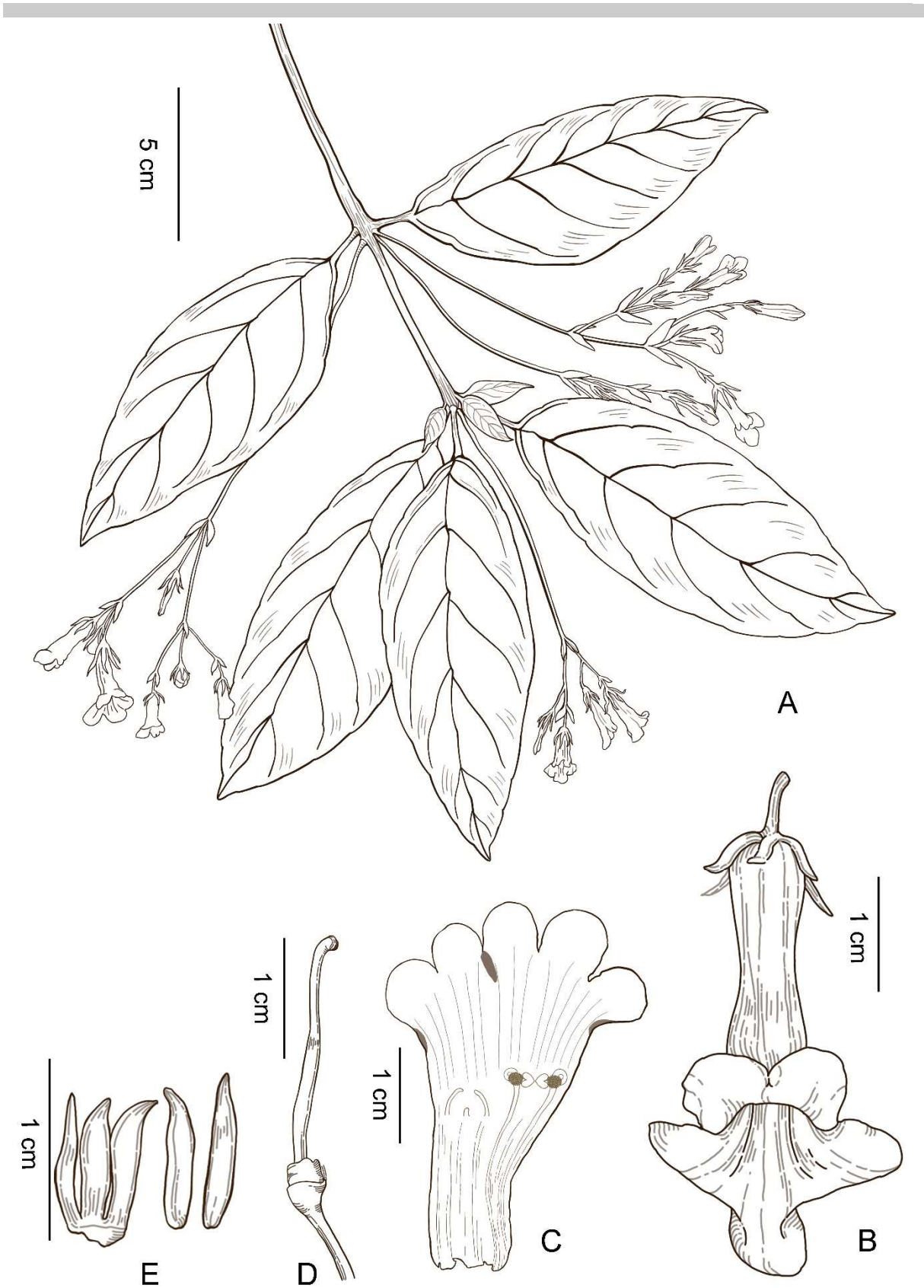
Fig. 2. Line drawing of Lysionotus cangyuanensis . A. branch with leaves and inflorescences; B. Flower; C. Dissected corolla, showing stamens and staminodes; D. Pistil and disc; E. Calyx. (Drawn by Ya-Nan Chen)