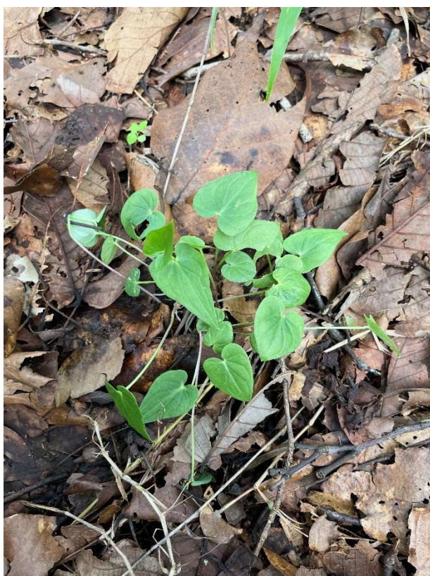
Fig. 3. Typhonium fornicatum sp. nov. Plants in habitat.

on the lower portion of the sterile interstice (3 vs. 8–10), and a spreading-declinate appendix (vs. erect appendix).