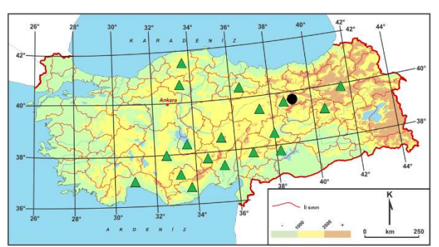
Fig. 4. Distribution map of Onosma guniae (black circle) and O. stenoloba (green triangle).

floristic region. It is only known from the type locality, located 7–8 km northwest of the province of Erzincan (Fig. 4). The species is found in serpentine rocky areas at elevations between 1500 and 1680 m.