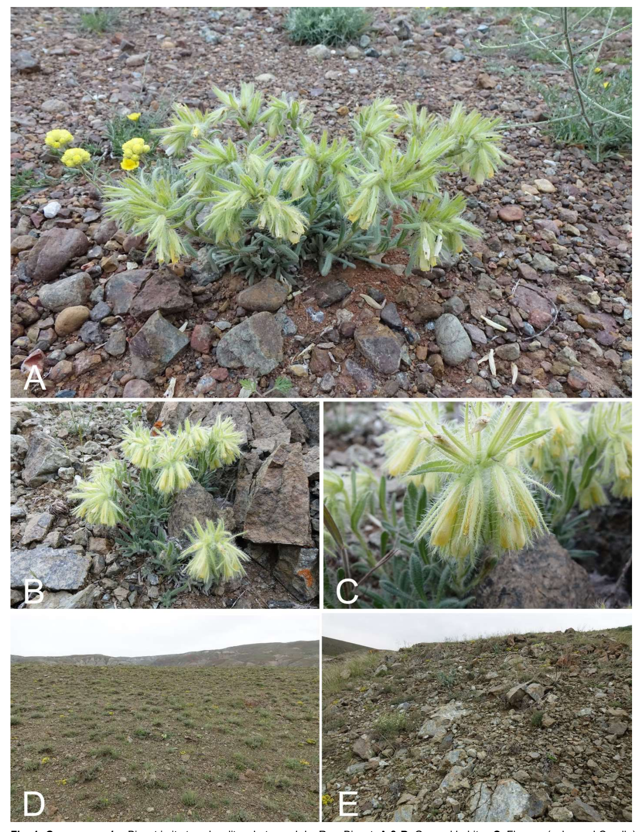
Fig. 1. Onosma guniae Binzet in its type locality. A & B. General habitus C. Flowers (calyx and Corolla) D & E. habitats