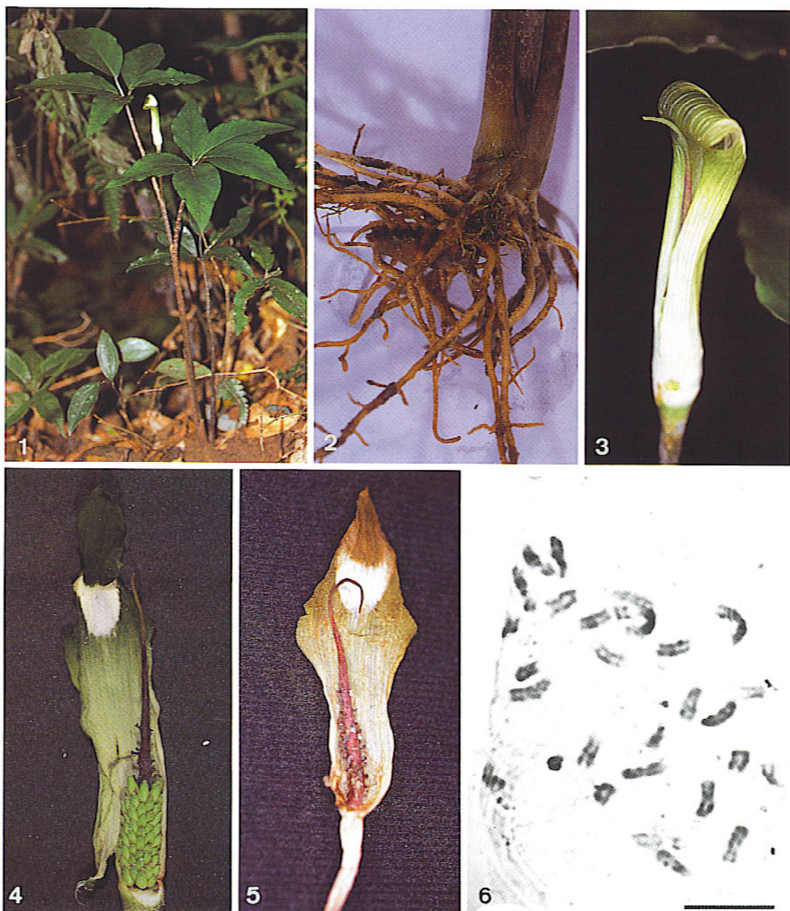
Figs. 1-6. The habitat, inflorescences and chromosomes of Arisaema nanjenense (Huang & Wu 16982, in Figs. 1-4 and 6; Huang 16978, in Fig. 5). Fig. 1: A plant growing along roadside in shade of broadleaved forest. Fig. 2: The rhizome and fibrous roots of the plant. Fig. 3: The inflorescence of a monoecious plant with glabrous appendage tip, with spathe opened artificially. Fig. 4: Open inflorescence of monoecious plant showing both staminate and pistillate flowers. Fig. 5: Open inflorescence of male plant showing staminate flowers, with faded brownish spathe. Fig. 6: Metaphase chromosomes, 2n=28 . Scale bar equal to 10 cm in Fig. 1, 1 cm in Figs. 2-5 and 10 \mu\text{m} in Fig. 6.