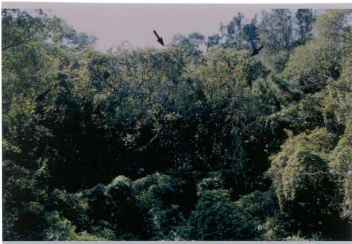
Fig. 4. Habitat (trees of Q. aliena pointed out by arrows).