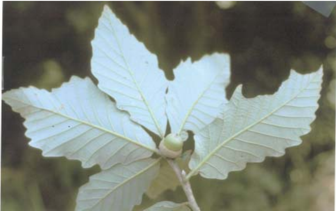
Fig. 3. Fresh leaves and fruits of Q. aliena .