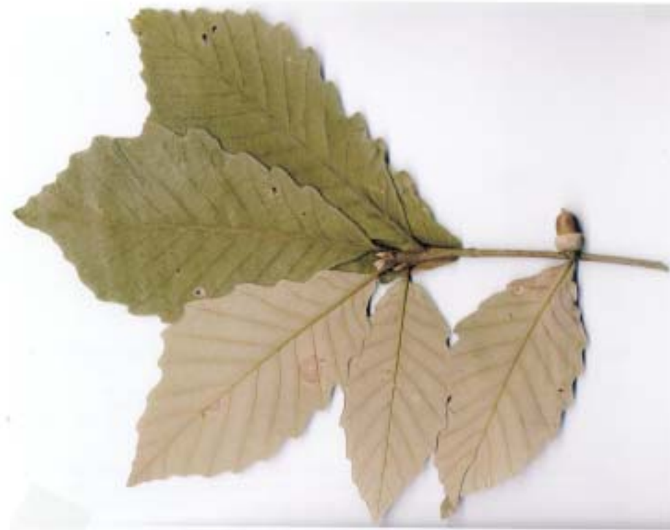
Fig. 2. Specimen newly collected (Wu 2638).

Distribution: China, Japan and Korea. Taiwan, found only at Fengshan near Niukoulin, Hsinchu County. N2452'53", E12057'43" (E246150, N2752650 in TWD67). Elevation is about 100 m.