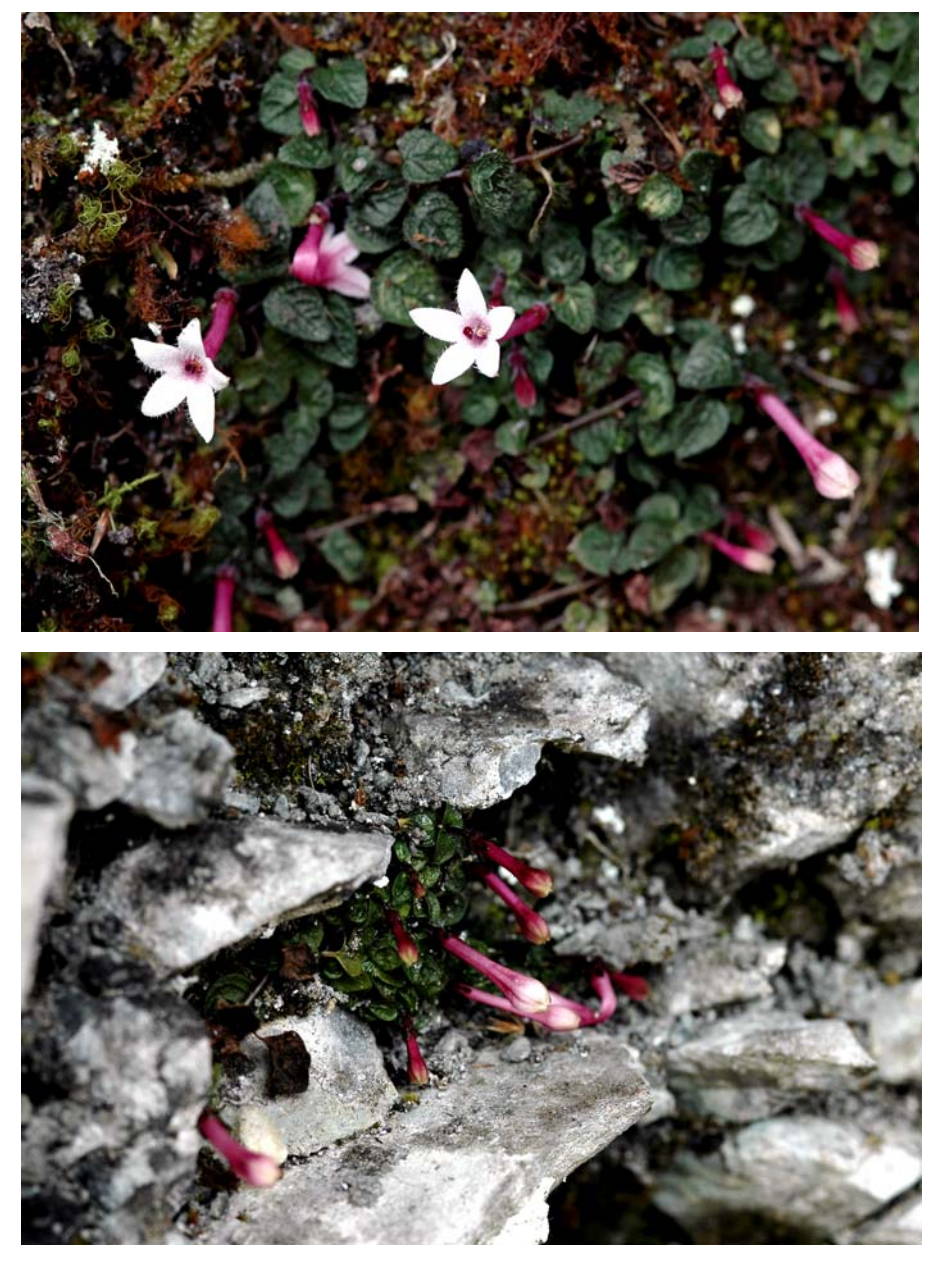
Fig. 2. Ophiorrhiza michelloides (Masam.) X. R. Lo. A: Plants with flowers. B: Flower buds and their habitat.

flowers are monomorphic with style reaching up to the mouth of the corolla tube and anthers with one filament ca. 1.5 mm long inserted at the throat of the tube. Other characters used to distinguish the Taiwanese plants from those of Mainland China included nearly glabrous lower leaf surface, sparsely haired petioles and exclusively prostrate growth habit. Based on the characters mentioned above, the plants from Taiwan are here recognized as being distinct from O. exigua . The taxonomic treatment of O. michelloides is given as follows. A detailed description, specimen citations and a line drawing of the plant are also provided.