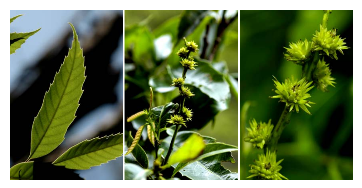
Fig. 2. Castanopsis chinenesis Hance. A: Leaf. B: Upper branch with pistillate flowers. C: Pistillate catkin.