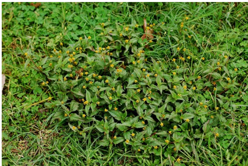
Fig. 1: Habitat of Acmella uliginosa (Swartz) Cassini.

narrowly to broadly ovate, apex rounded to acute, margin entire to irregularly dentate, sparsely to moderately ciliate. Ray florets 4-7, inconspicuous and only slightly exceeding the phyllaries; corollas 1.8-2.2 mm long, yellow to orange-yellow; tube 0.7-0.9 mm long, 0.1-0.3 mm in diameter; limb 0.9-1.2 mm long, 0.8-1 mm wide, achenes moderately to densely ciliate with straight-tipped hairs, lacking an evident cork-like margin and shoulders; pappus of 2-4 short subequal bristles, 0.3-0.4 mm long. Disc floret corollas 1.2-1.3 mm long, yellow, 4-merous; tube 0.3-0.4 mm long, 0.2-0.3 mm in diameter; throat 0.8-1.0 mm long, 0.4-0.5 mm in diameter; lobes 0.2-0.3 mm long, 0.2 mm wide; stamens 0.6-0.9 mm long, anthers brown-black; style 0.9-1.1 mm long, the branches 0.3-0.5 mm long; achenes 1.2-1.5 mm long, 0.4-0.6 mm wide, moderately to densely ciliate with straight-tipped hairs, lacking an evident cork-like margin and shoulders; pappus of 2 sub- or unequal bristles, the longer bristle 0.4-0.7 mm long, the shorter 0.2-0.4 mm long.