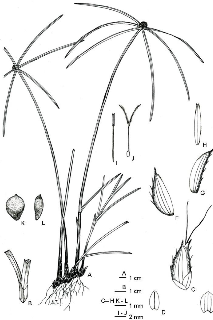
Fig. 3. Kyllinga polyphylla Willd. ex Kunth. A: Habit. B: Part of culm, showing the ligule and leaf base. C: Spikelet. D: Adaxial outer glume. E: Abaxial inner glume. F: Adaxial middle glume. G: Abaxial middle glume. H: Abaxial inner glume. I: Anther. J: Pistil. K: Achene. L: Achene, lateral view.