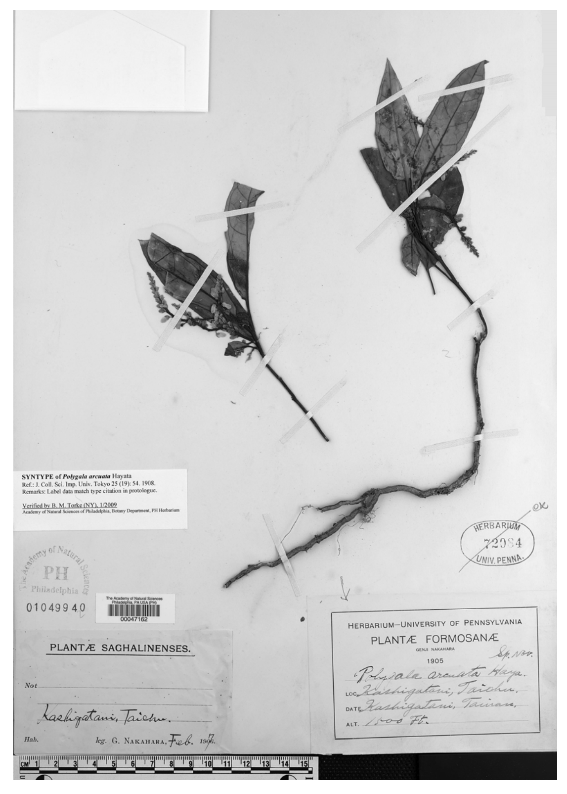
Fig. 4. Syntype of Polygala arcuata Hayata deposited at PH. The collection is G. Nakahara s. n. (year 1907). Note the stamp and second label from the University of Pennsylvania Herbarium. See Table 3 for additional details.