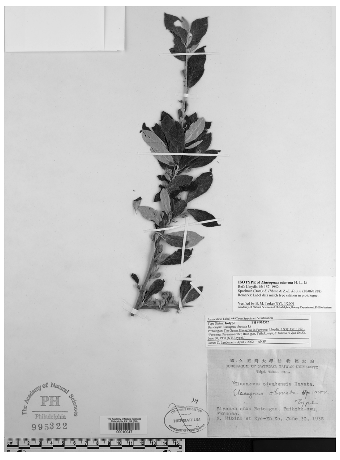
Fig. 3. Isotype of Elaeagnus obovata H. L. Li deposited at PH. The collection is S. Hibino & Z.-E. Ko s. n (year 1938). Note the National Taiwan University label and the stamp of the herbarium of the Morris Arboretum. See Table 3 for additional details.