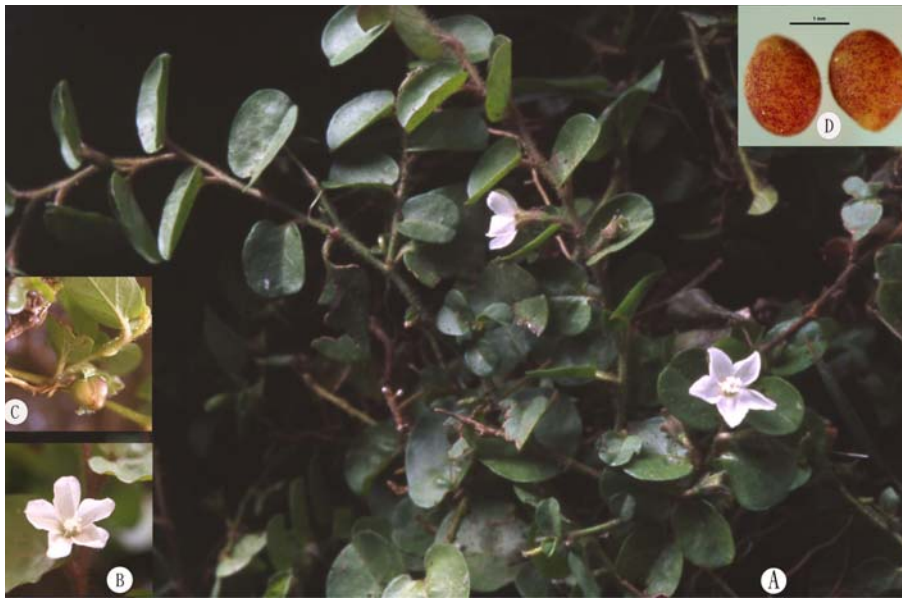
Fig. 3. Evolvulus nummularius (L.) L. A: Habit. B: Flower. C: Capsule. D: Seeds. Bar = 1 mm.