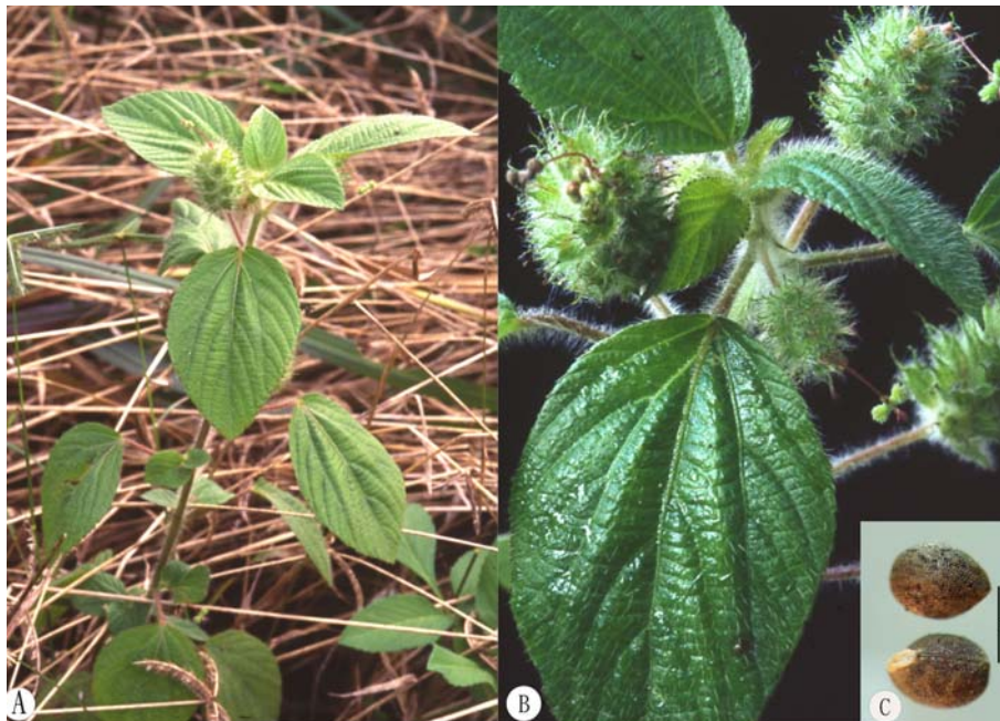
Fig. 4. Acalypha aristata Kunth. A: Habitat. B: Flowering branch showing pistillate spikes. C: Seeds. Bar = 1 mm.