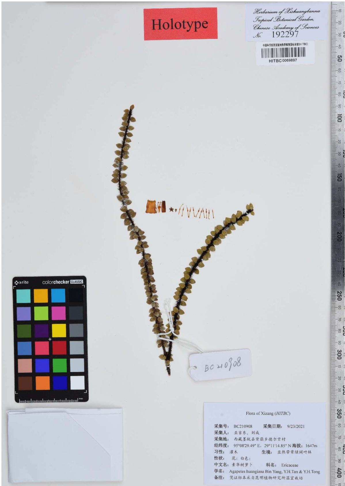
Fig. S2. Holotype of Agapetes huangiana (HITBC0069897).