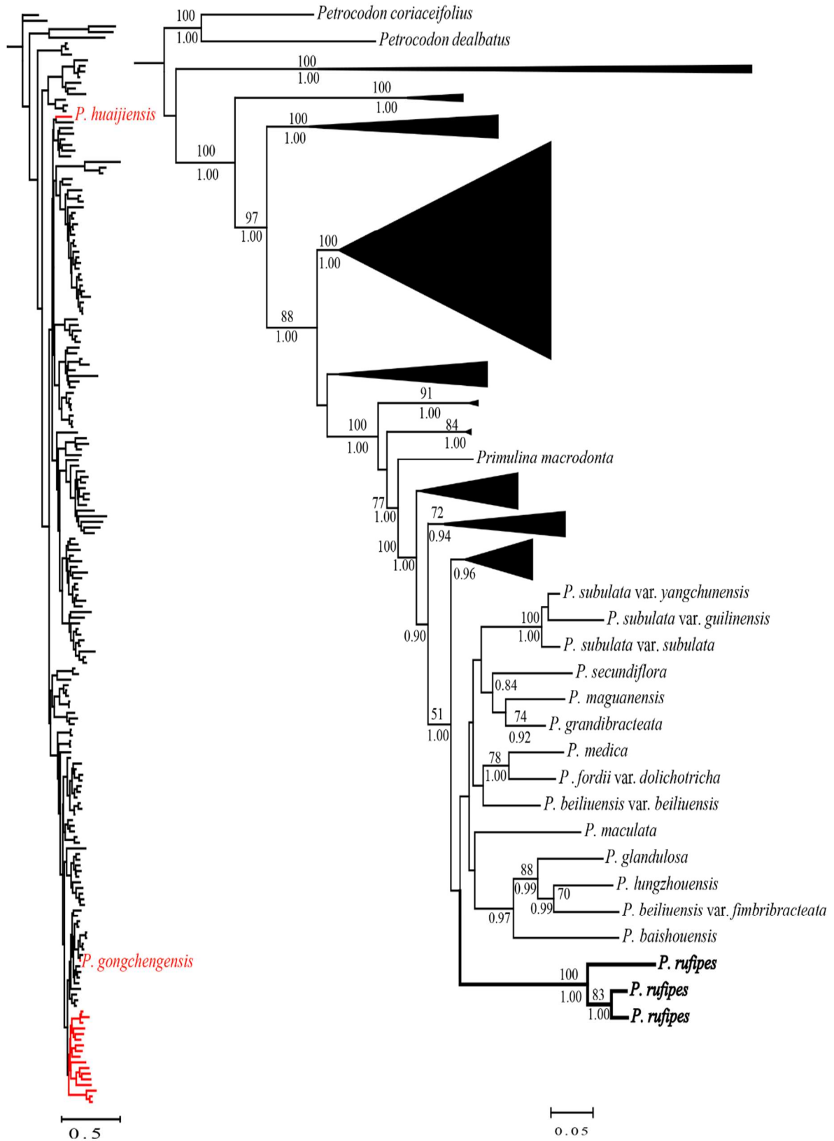
Fig. 1. The Bayesian phylogenetic trees from the analyses of the combined data of the ITS and chloroplast trnL-F regions. Bayesian posterior probability (PP > 0.5) and ML bootstrap support values (BS >50) are shown above and below the branch around the corresponding node. The accessions of Primulina rufipes are highlighted in bold.