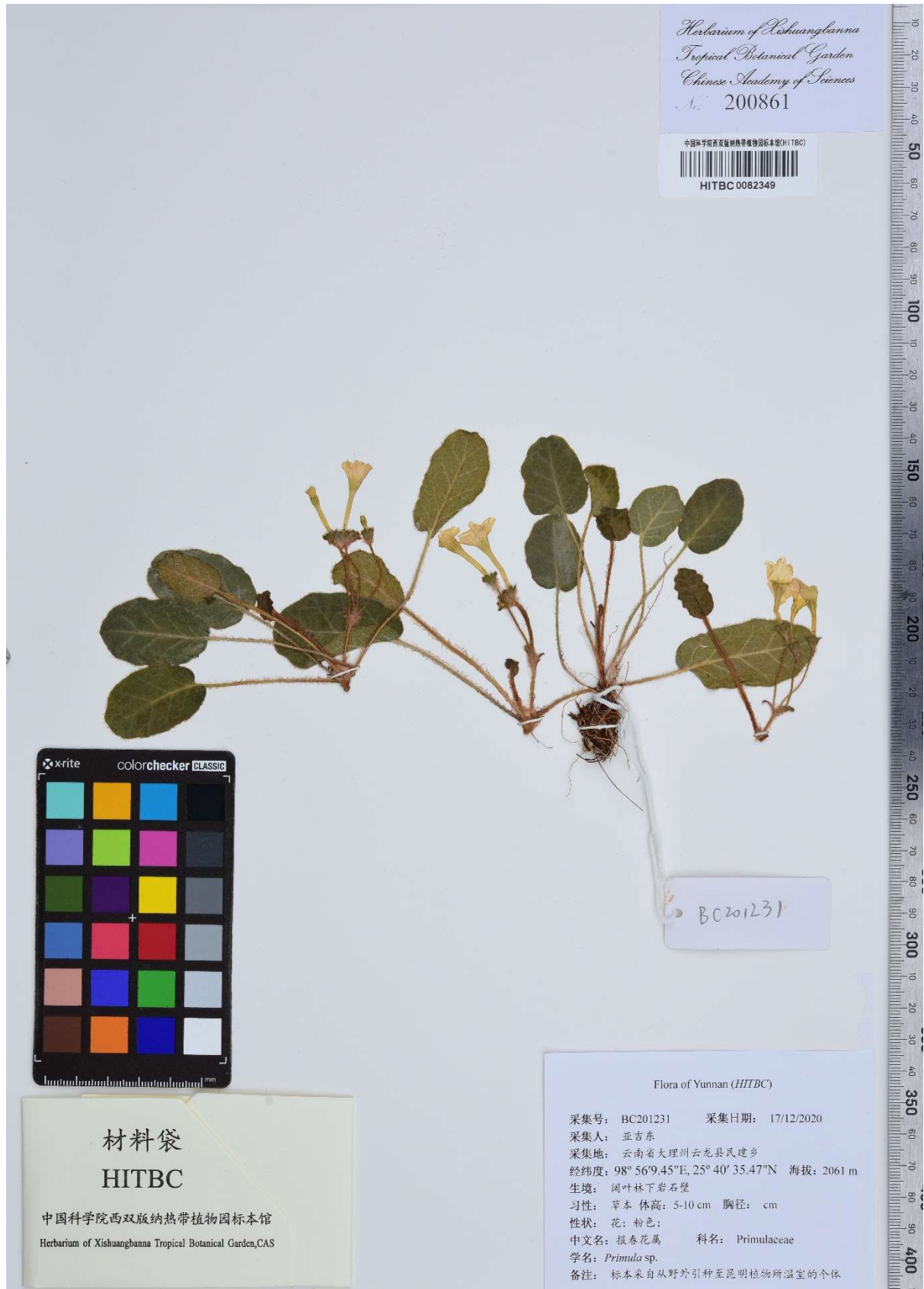
Fig. S1. Holotype of Primula sugongii (HITBC0082349).