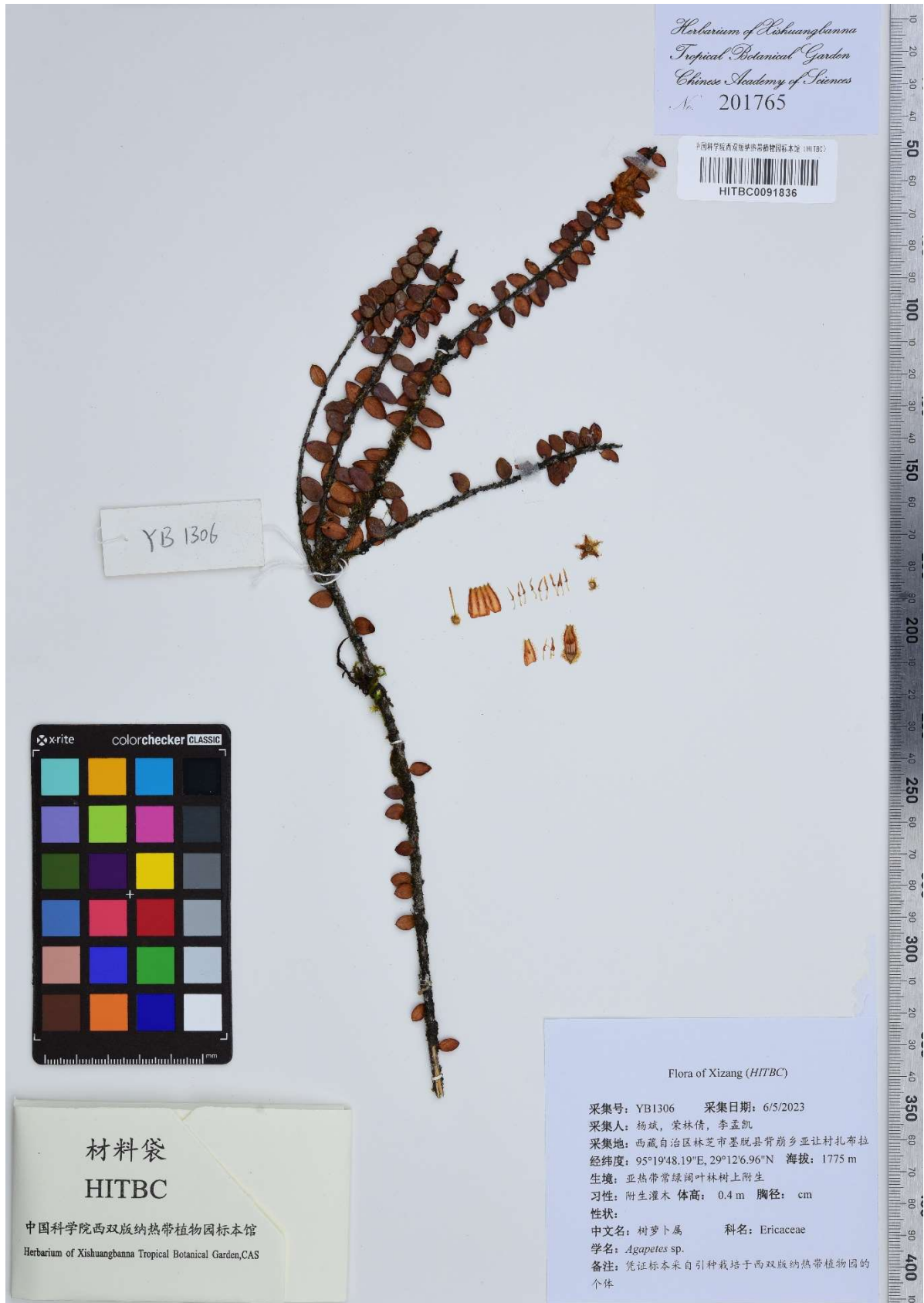
Fig. S2. Holotype of Agapetes rhuichengiana (HITBC0091836).