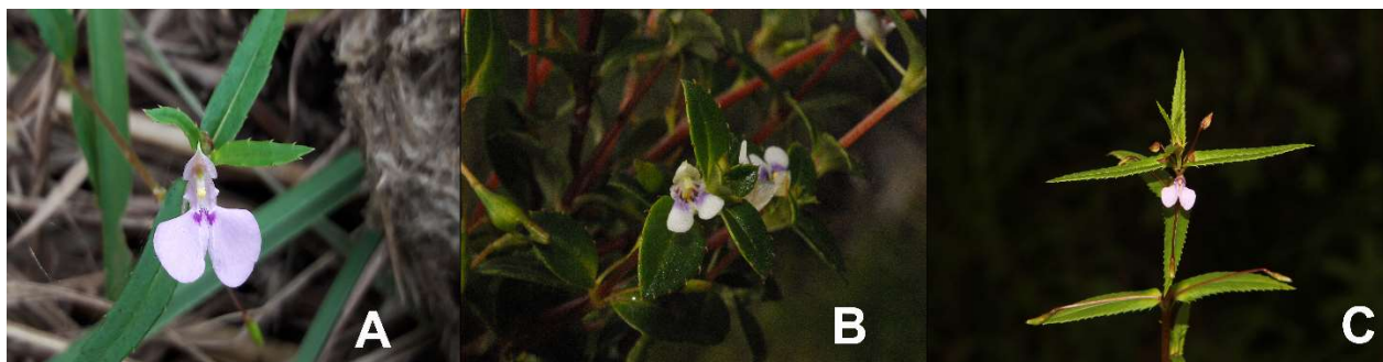
Fig. 2. Morphological comparison of three related species. A. Impatiens brahmagiriana ; B. I. inconspicua ; C. I. madapurae .

*Based on the original protologue (Benth. ex Wight & Arn., Prodr. Fl. Ind. Orient. 139. 1834), type specimens (Wall. Numer. L. No. 4741 – K001039801, K000720273, G00237322 and G00237323) and Bhaskar thesis (141: 2012); **based on the original protologue (Bhaskar and Sringswara, 2017).