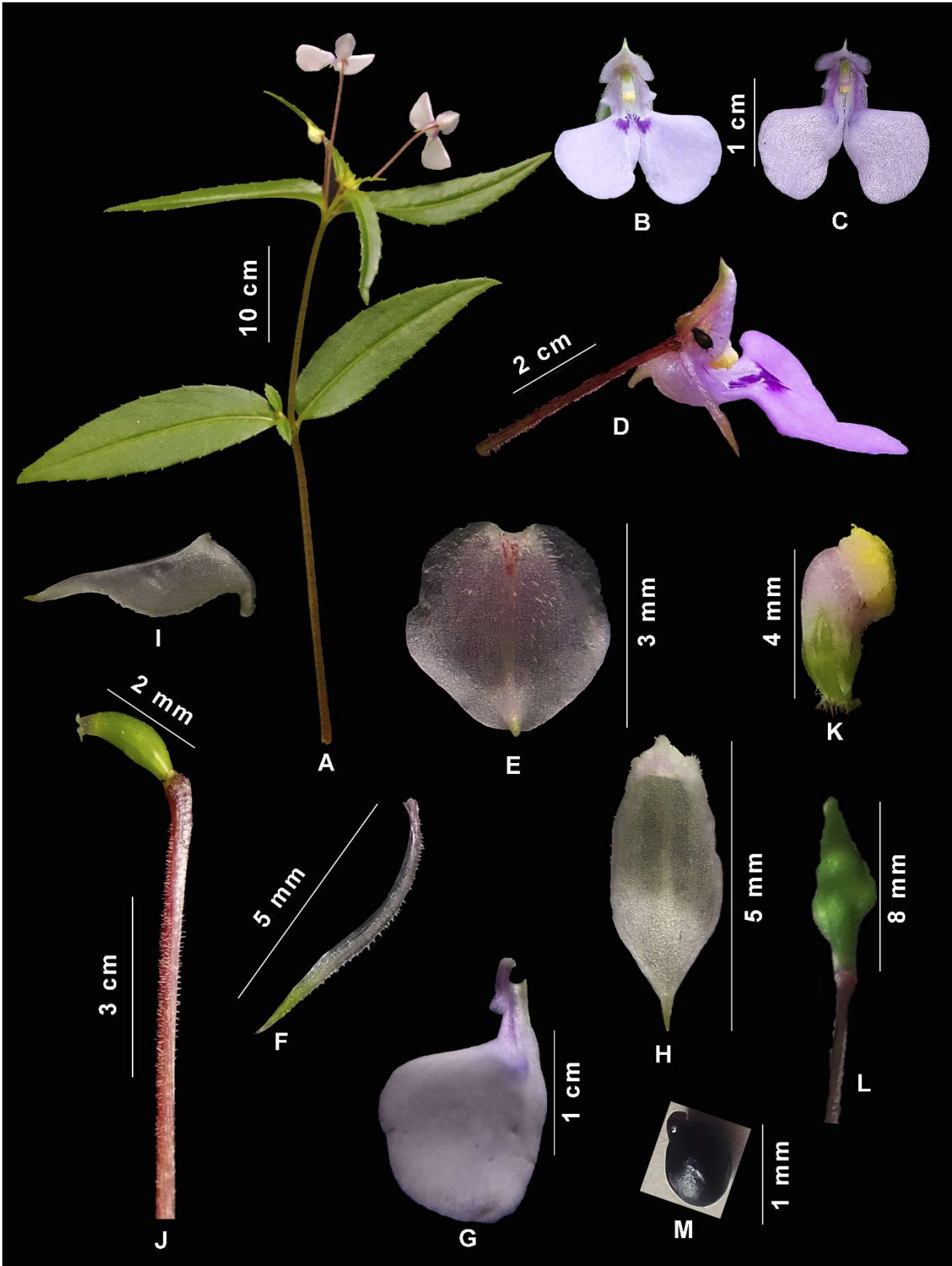
Fig. 1. Photo plate of Impatiens brahmagiriana T. S. Saravanan & S. Kaliamoorthy A. A portion of plant; B. Flower with violet blotch on throat; C. Flower without violet blotch; D. Lateral view of the flower; E. Standard petal; F. Lateral sepal; G. Wing petal; H. Lip; I. Lip showing the spur; J. Ovary with pedicel; K. Androecium; L. Mature fruit with pedicel; M. Seed.