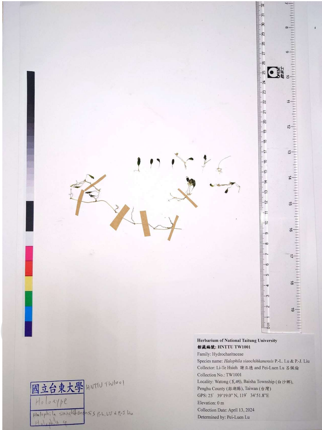
Fig. S1. The holotype of Halophila siaochihkanensis .

The following supplementary materials are available for this article: Liu, P.-J., Lin, C.-W., Lin, W.-J., Lin, H.-J., Hsieh, L.-T., Cai, C.-X., Hong, M.-Y., Lu, P.-L., 2025 Halophila siaochihkanensis (Hydrocharitaceae), a new species from Penghu County, Taiwan. Taiwania 70( ): - . doi: 10.6165/tai.2024.70.