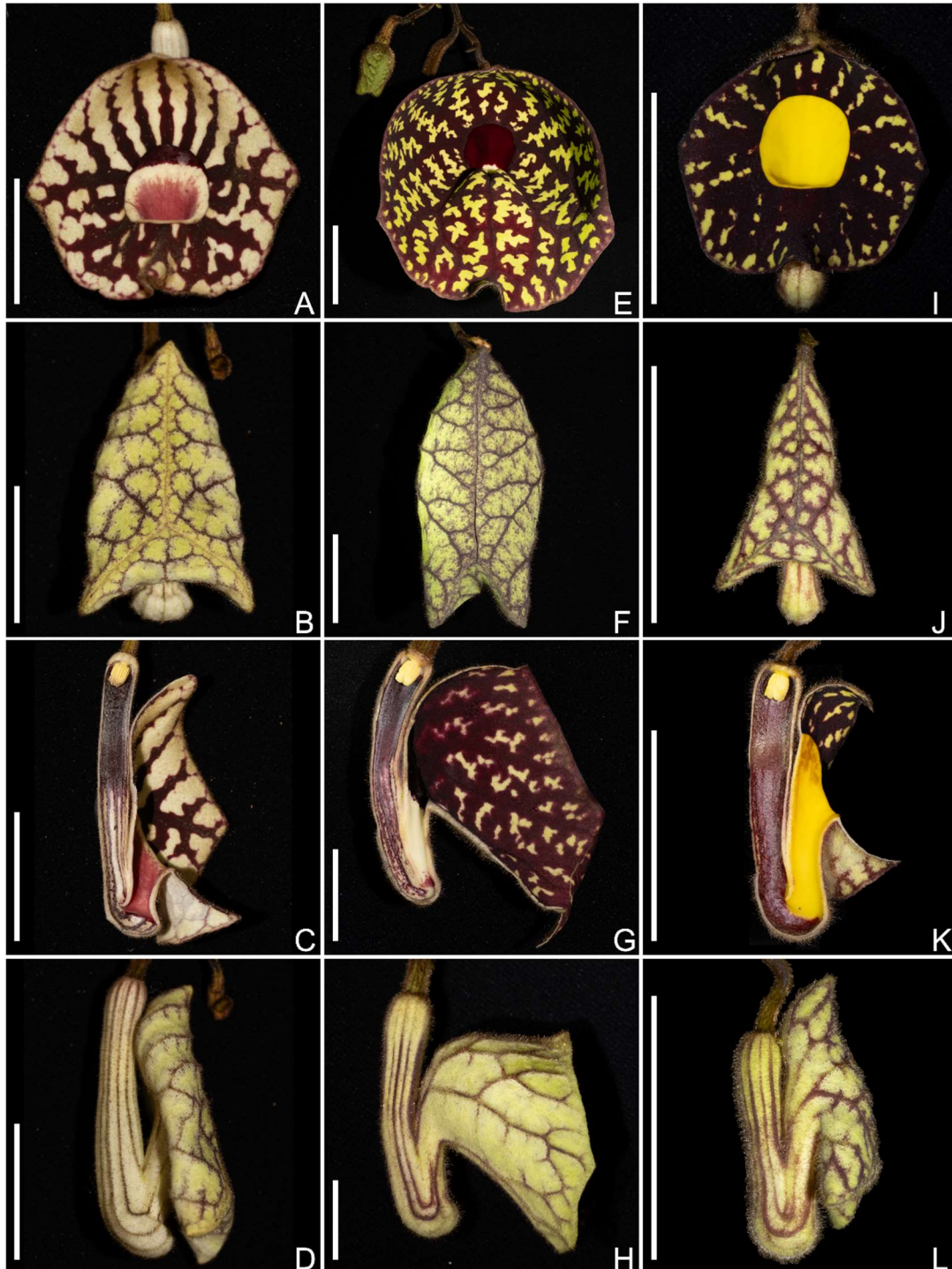
Fig. S1. Morphological comparison I. A–D. Aristolochia geantha ; E–H. A. petelotii ; I–L. A. austroyunnanensis . A, E & I. Frontal view of the flowers; B, F & J. Frontal view of the buds; C, G & K. Longitudinal dissection showing the adaxial side of the perianth; D, H & L. Lateral view of the buds. Scale bars for each image are shown at the bottom left of each figure panel; all scale bars = 5.0 cm.

The following supplementary materials are available for this article: Guo, Z.-R., Wang, Y.-F., Onyenedum, J.G., Li, J. 2025 Aristolochia geantha (Aristolochiaceae), a new species from Yunnan, China. Taiwania 70(2): 293-300. doi: 10.6165/tai.2024.70.293