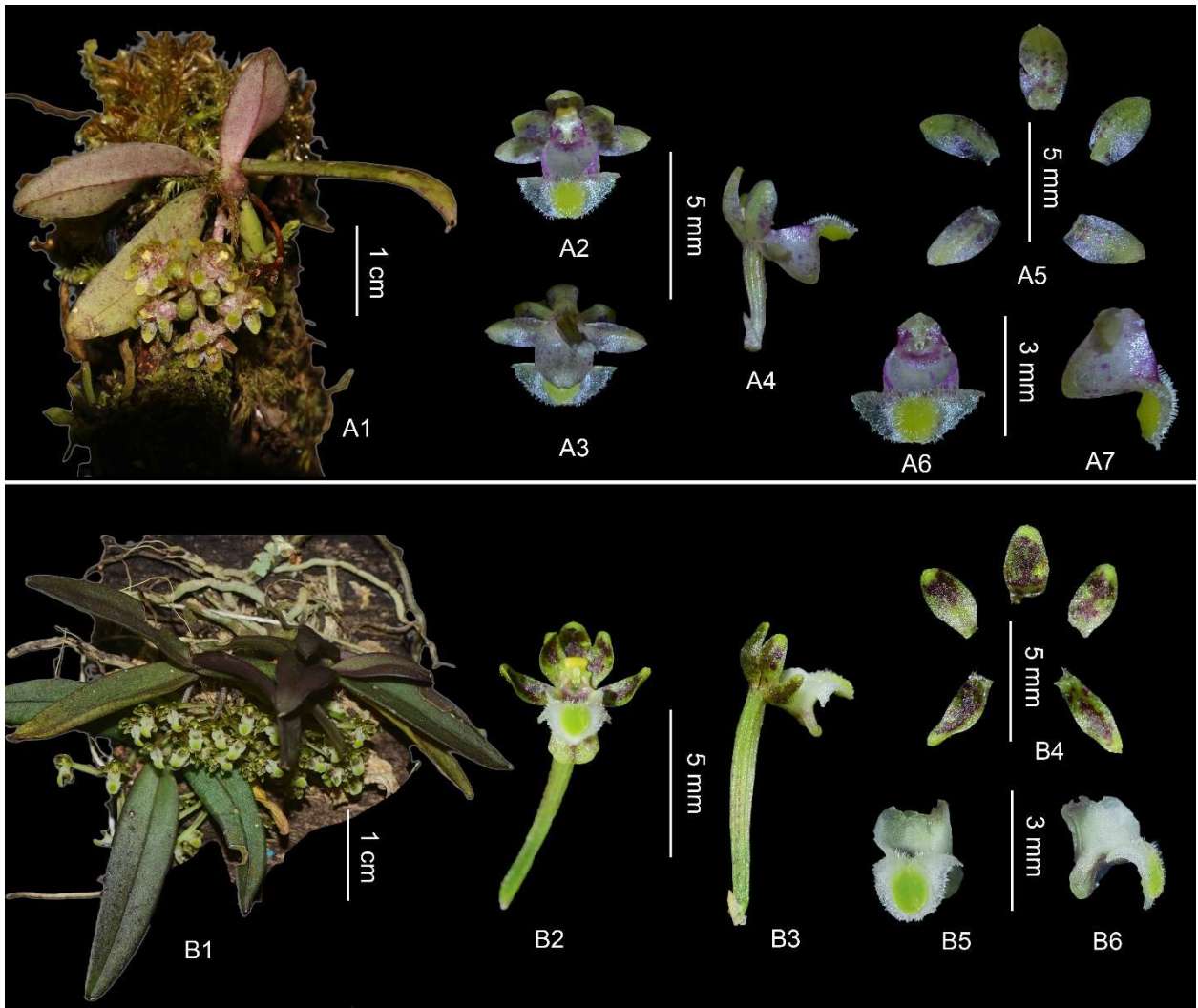
Fig. S2. Morphological differences between Gastrochilus motuoensis and its closely related species. A1-A7. G. motuoensis ; B1-B6. G. platycalcaratus .